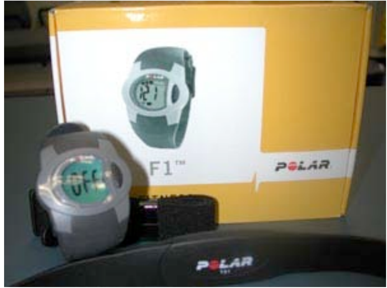
POLAR HEART MONITORS $69.95

Polar F1 heart rate monitor features continuous HR, exercise timer and stores exercise time and average HR.