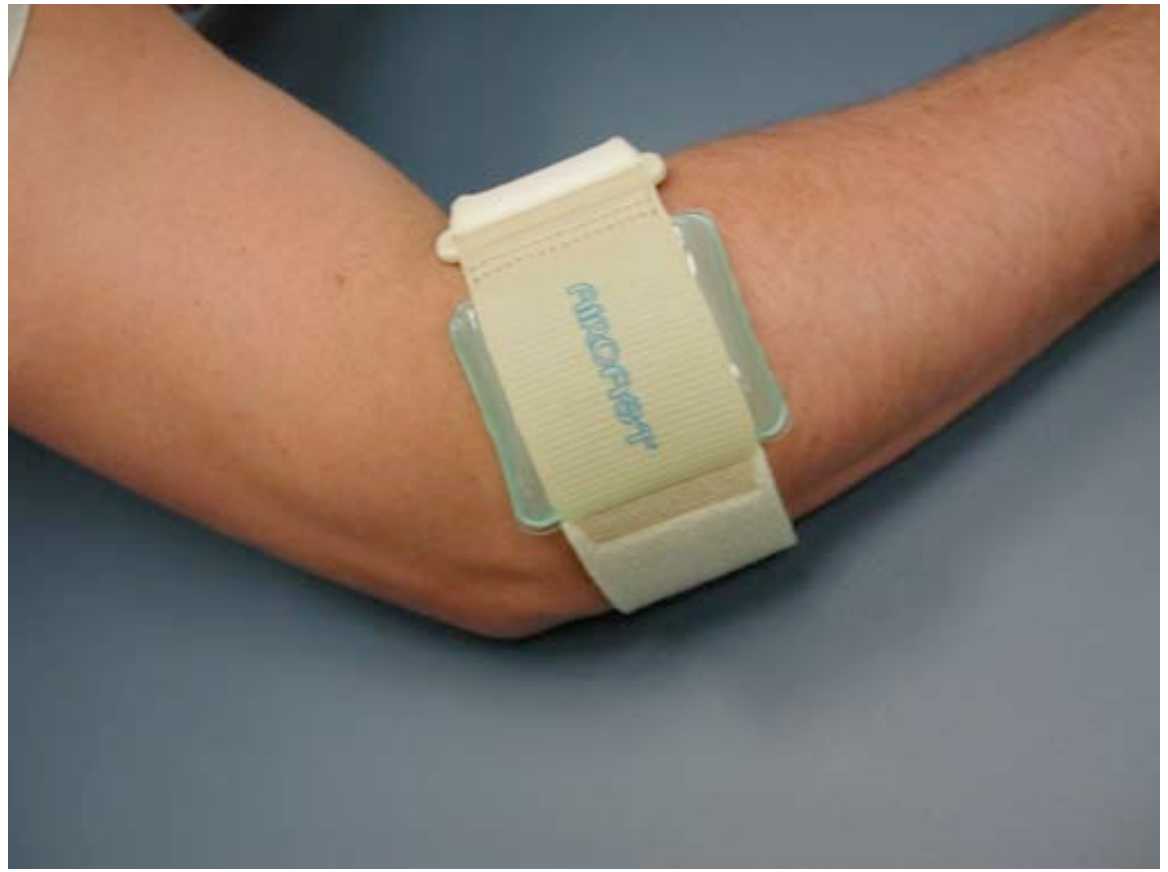
Aircast Pneumatic Armband $15.95

Providing relief for tennis elbow. The aircast pneumatic Armband applies 50% more pressure where it counts – on the extensor muscles not around the arm. Clinical studies verify that 86% of patients found relief wearing the versatile Aircast Pneumatic Armband.