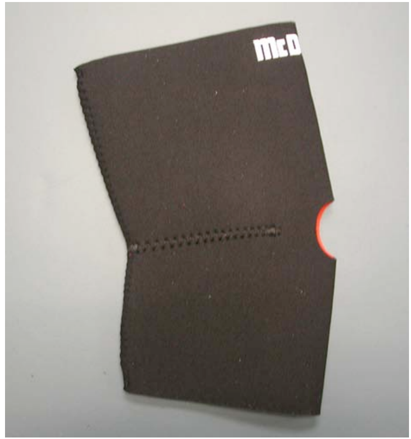
McDavid Neoprene Support $9.25

Effective on a variety of problems, such as muscle strains, sprains, hamstring pulls and tennis elbow. Heavy-duty outer nylon for longer life. Cut away for kneecap or elbow. Color: Black