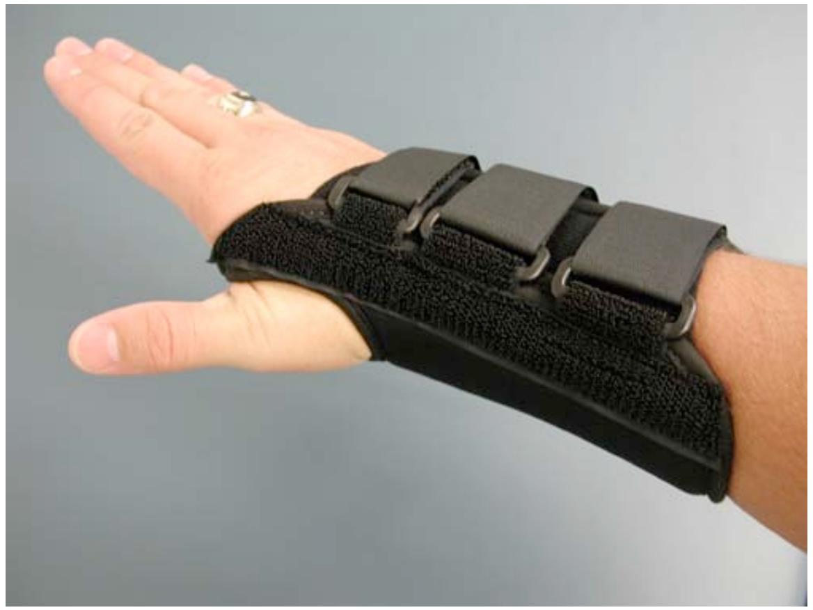
ComfortFORM WRIST BRACE $14.25

Durable, lightweight fabric is LYCRA lined for breathability and patient comfort. Adjustable by three Velcro straps. Ideal for sprains, strains and control of carpal tunnel syndrome. Sizes: S-XL, Left and Right available. SR-SUP-5 through 56