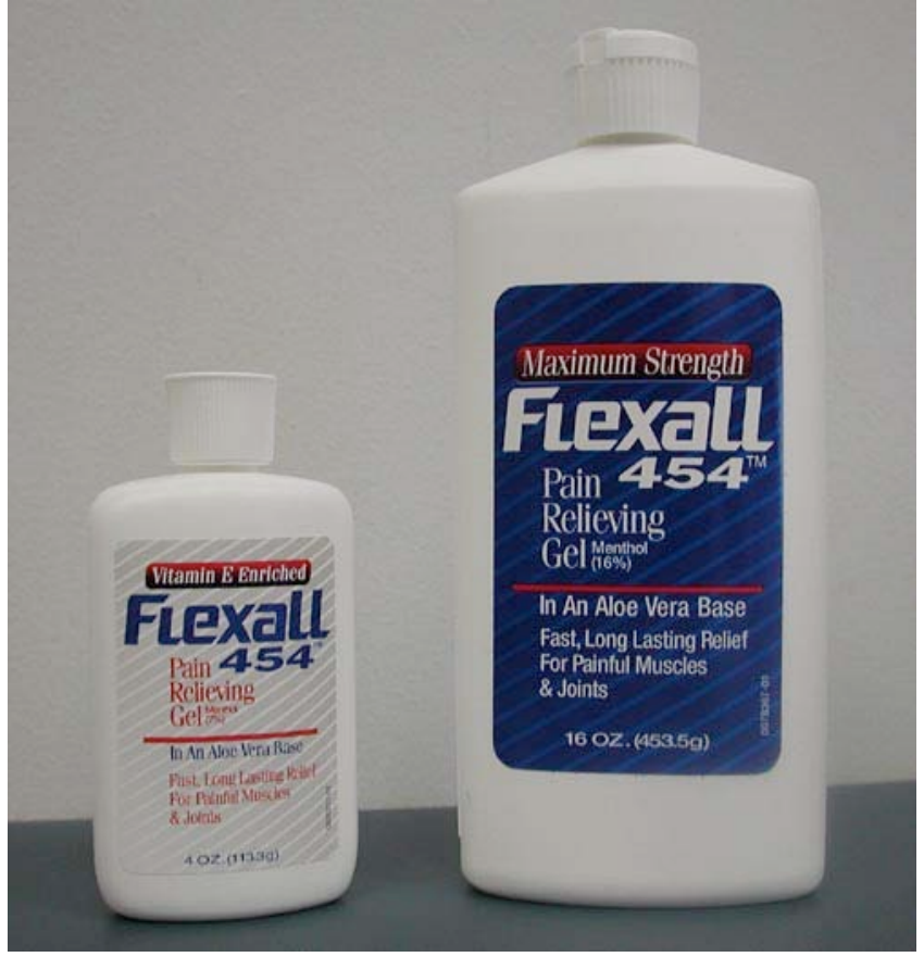
FLEXALL 454 4oz Bottle $7.25 (SR-MOD-83) 16oz Bottle $18.95 (SR-MOD-82)

Penetrating relief from pain and stiffness of muscles and joints. Use with ultrasound, soft tissue massage, ice, breathable wraps and between TENS treatments. Aloe vera-based, absorbs quickly, is greaseless and non-staining.