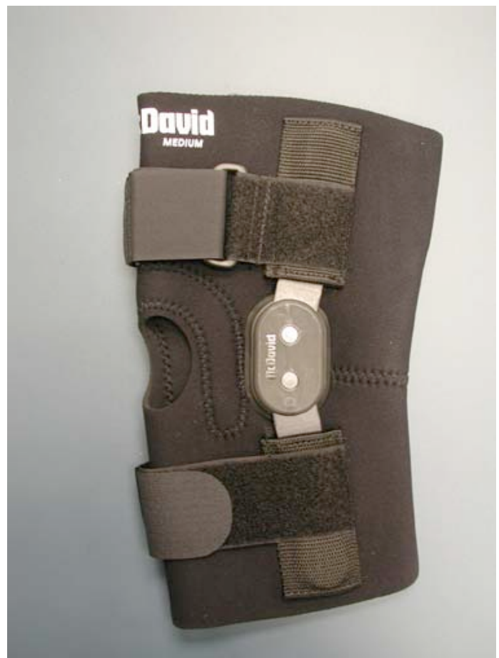
McDavid 429 PSII Hinged Knee Brace $56.95

A lightweight but advanced knee support. Long sleeve, 3/16" thick thermal neoprene with geared polycentric hinges, hyperextension stops and condyle pads for enhanced fit and comfort. A superior design engineered for lightweight protection in most sports and activities. Great for MCL, LCL sprains, meniscal injury, patellar-femoral injury and much more. Sizes: M, L, XL (SR-SUP-30,31,32)