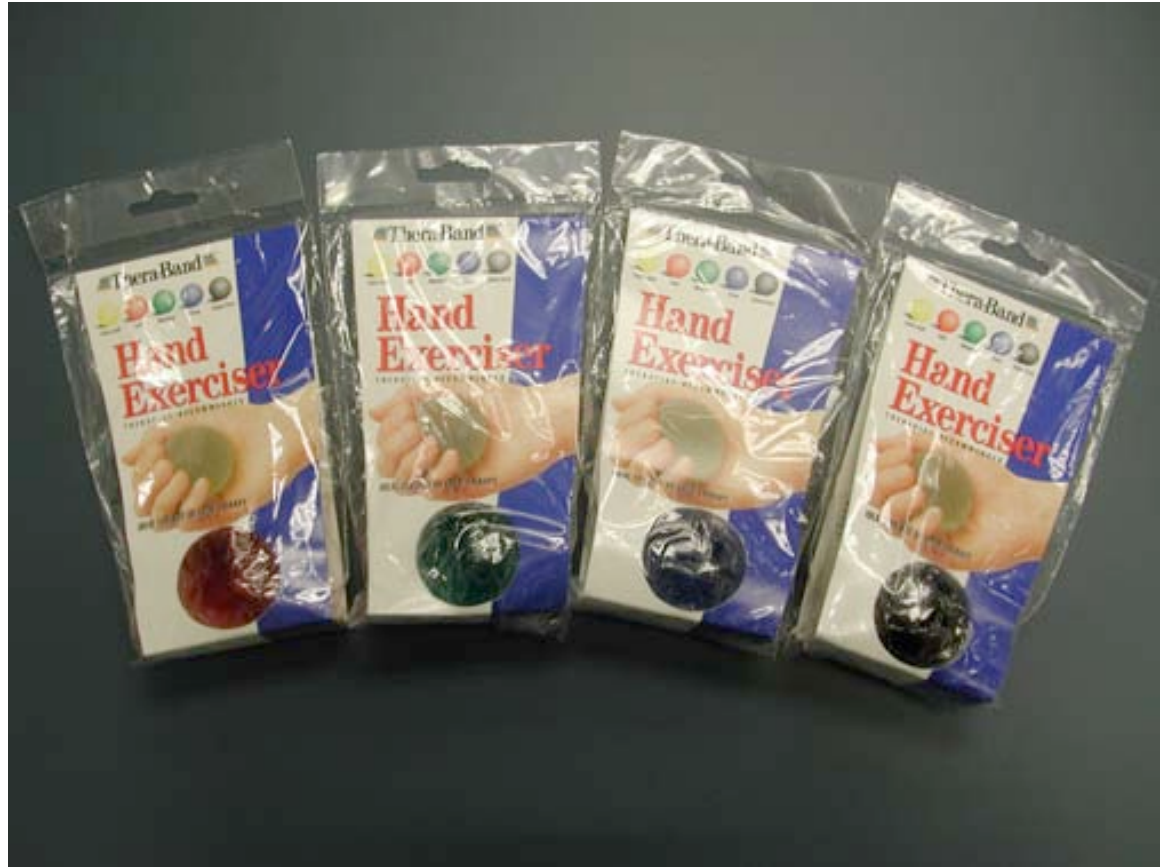
THERA-BAND HAND EXERCISER