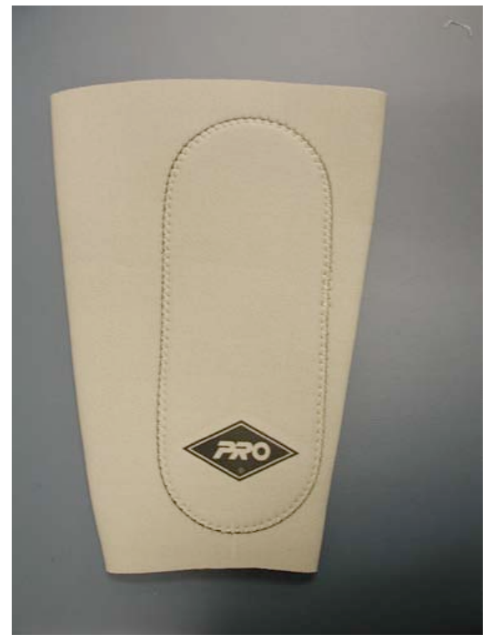
PRO Orthopedic Thigh Sleeve $14.75

General purpose support compresses and supports soft tissue while retaining therapeutic heat. Helps reduce muscle strains.