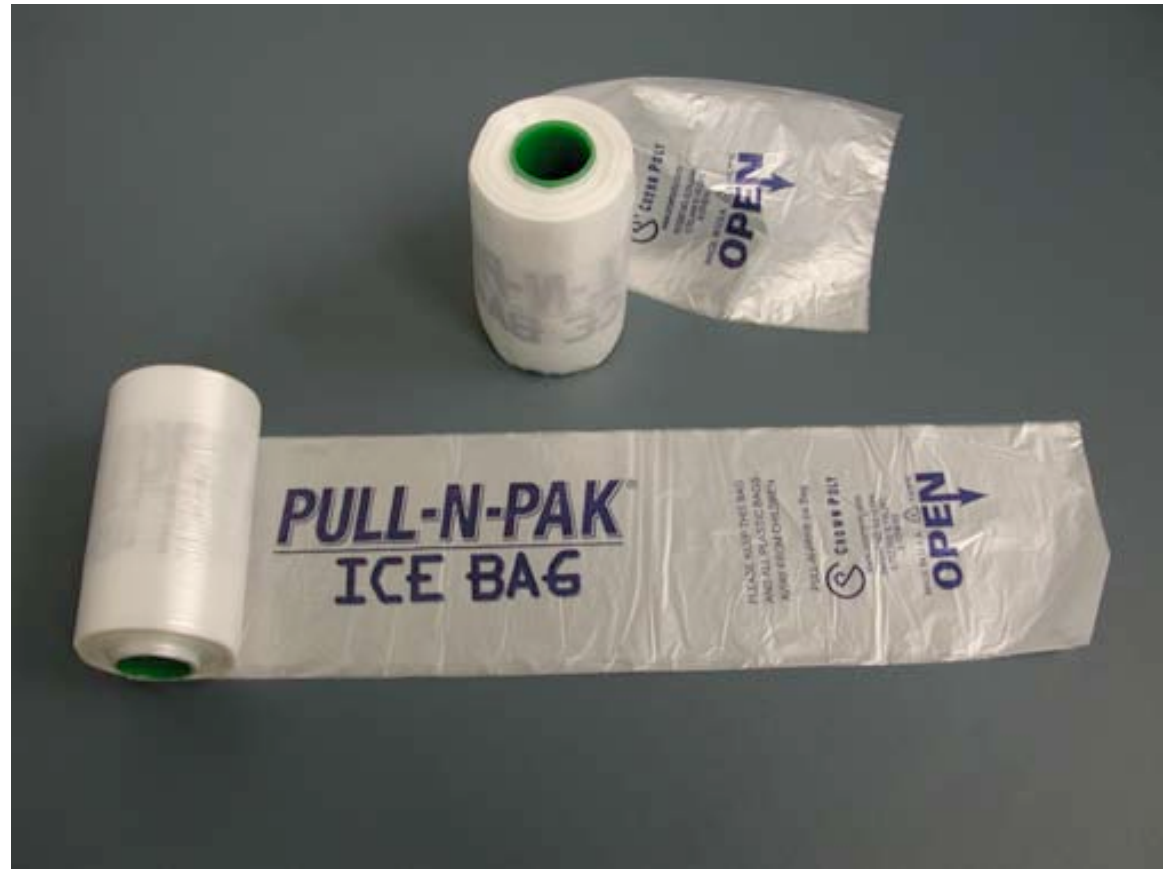
PULL-N-PAK ICE BAGS $2.25

50 bags per roll. Perfect for at home, work or in your work vehicle for icing injuries throughout the day. Will not leak or break.