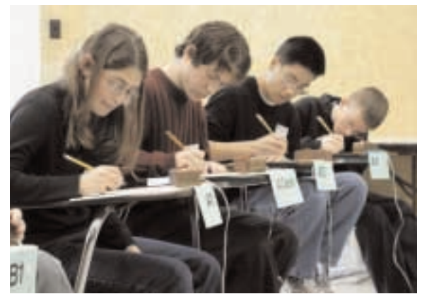
PENCILS POISED , students on the Granada High School team calculate an answer during the morning elimination rounds.

In a daylong event Jan. 26 at Las Positas Col-