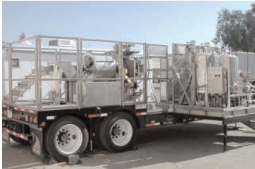
HAVE WHEELS, WILL TRAVEL — A fully self-contained EDS system is mounted on a tractor-trailer rig, ready for shipment to the Army's Aberdeen Proving Ground, where it will undergo formal operational testing beginning this month.

This new EDS trailer becomes the second slated for operational deployment. The first EDS, a prototype, was deployed to the field last year, following engineering development testing at Porton Down, England. Although never intended for field use, the prototype was