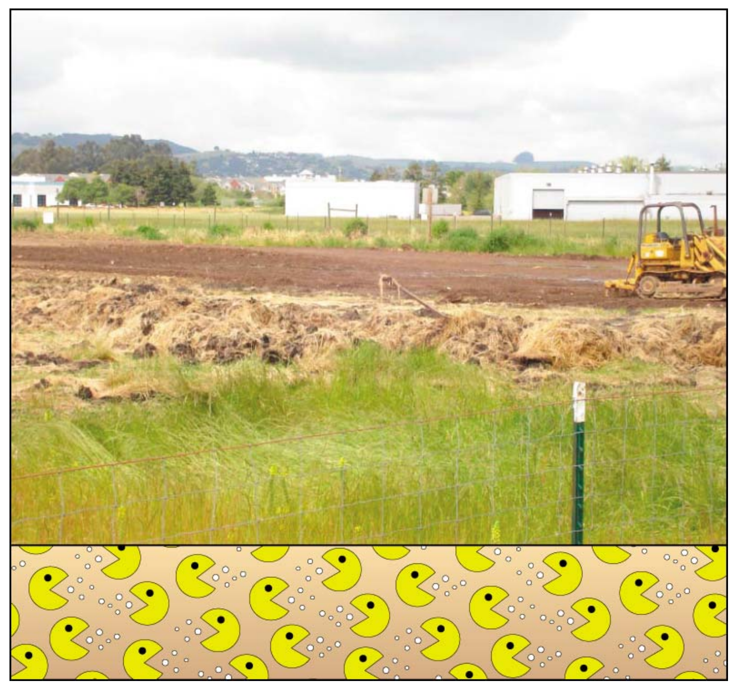
Figure 3: Groundwater under treatment through natural attenuation. In natural attenuation, one mechanism at work is the break-down of contamination by natural bacteria in the ground, depicted conceptually in this figure.

After evaluating the clean-up options, EPA prefers monitored natural attenuation with institutional controls (RA-3) as the remedy that provides the best balance of the criteria. EPA expects RA-3 to satisfy the following statutory requirements of CERCLA, Section 121(b): (1) be protective of human health and the environment; (2) comply with ARARs (or justify a waiver); (3) be cost-effective; (4) utilize permanent solutions and alternative treatment technologies or resource recovery technologies to the maximum extent practicable; and (5) satisfy the preference for treatment as a principal element. Once the clean-up standard for 1,1-DCA has been reached, EPA believes that no contamination above clean-up levels will remain onsite, and any use restrictions may be lifted.