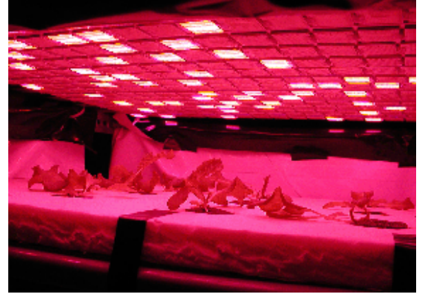
Fig. 2 Lettuce plants growing under an overhead con-

Another development is an adaptive system in which each light engine can be operated independently, and photodiodes can detect reflectance patterns off of leaves from flashing green LEDs, thereby indicating positions of leaves within the foliar canopy relative to any given light engine on a lightsicle. When this advanced hardware is coupled to tailored software, the reflectance can be used to auto-detect changes in plant growth and adjust the lighting accordingly. These lighting systems have been tested with cowpea, pepper ( Capsicum annuum L. cv. Triton) and Lettuce ( Lactuca sativa L. cv. Waldmanns Green, Fig. 2) with limited testing of other ALS candidate crop species.