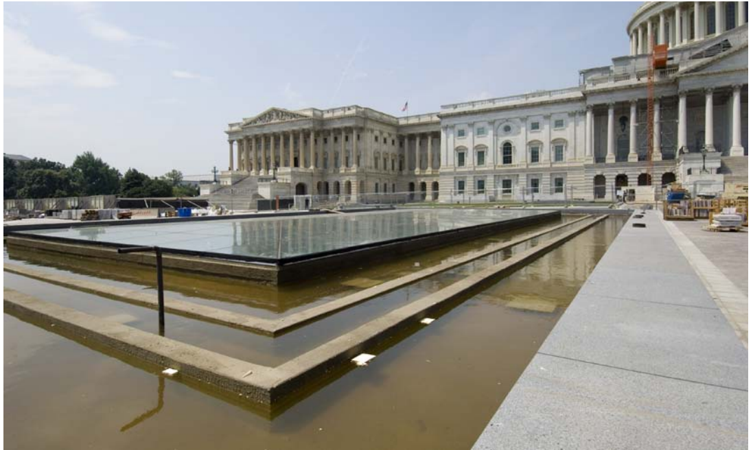
A pool of water sits within an 8-foot-wide basin surrounding one of the two large Great Hall skylights to test the waterproofing membrane within the basin. Eventually, a pool of water will slowly revolve around a black granite slab that will rest on the pedestal walls visible in the center of the basin.