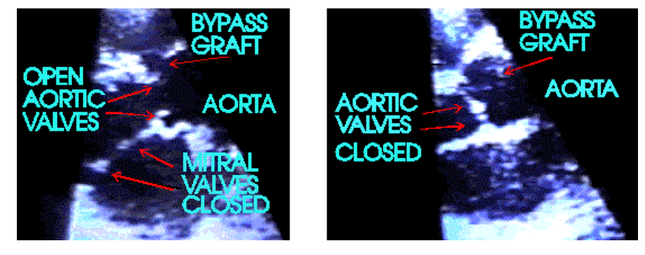
Figure 1: A pulse echo imaging of the Aortic valve in real time, allowing visualization of the heart valve in motion. [Ref-. http://www.webcom.com/ld vonch/cardult.html].

The Doppler shift principle has been used for a long time in fetal heart rate detectors. Recent developments, such as the use of real-time color flow mapping which clearly depicts the flow of blood in the vessels, and allows measurement determinations makes the method a very effective diagnostic tool. The use of real-time color flow mapping clearly depicts the flow of blood in the vessels. Color Doppler is particularly indispensable in the diagnosis and assessment of heart valve disorders, congenital heart abnormalities and the visualization of reduced blood flow in diseased vessels. The development of real-time imaging with the selectable combination of color hues onto shades of gray has added a powerful imaging capability for viewing subtle tissue details. This enhancement provides a better interpretation of the ultrasonic images. The use of 3-D imaging is being developed for volumetric measurements as well as to enhance image interpretation and presentation.