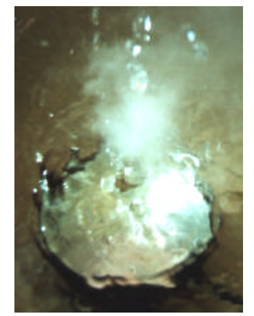
FIGURE 3: Water streaming at the focus of a 250-KHz lens.

B. Recovered artery after 30 minutes of treatment.