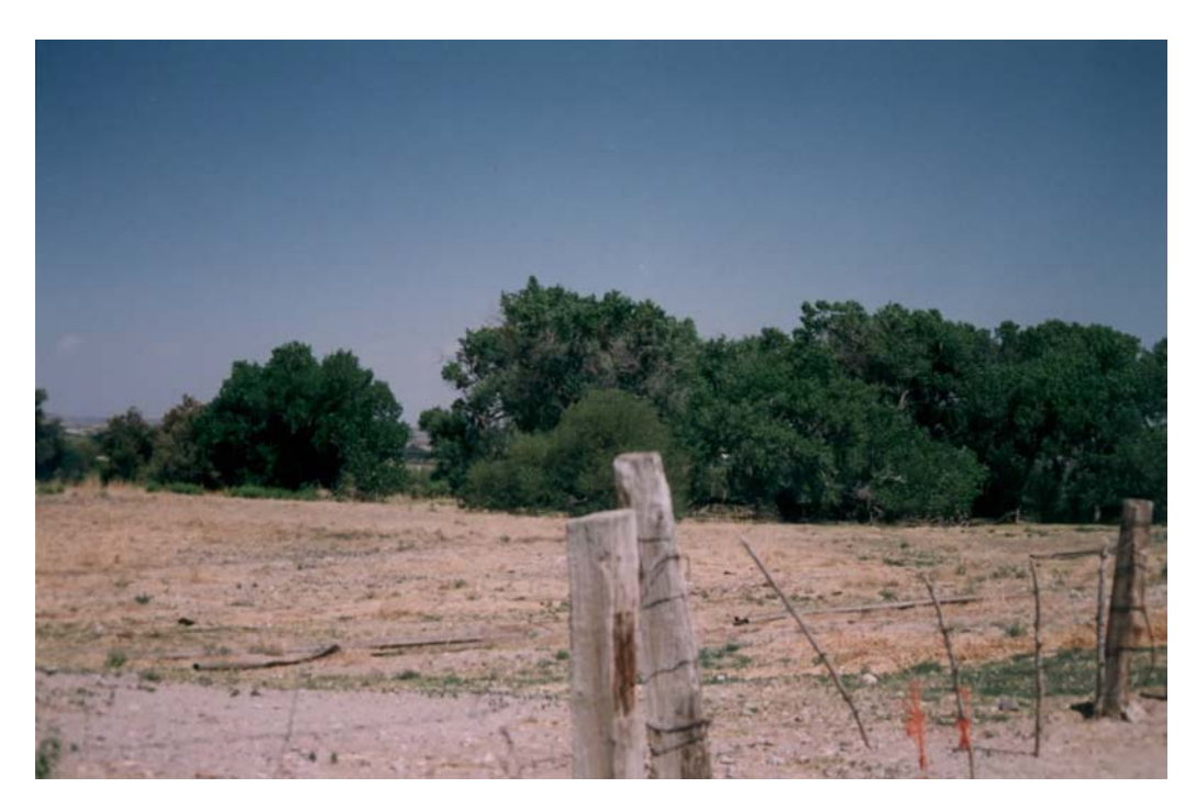
G3 : Green ash and cottonwoods dominate the center of the flood plain. The area surrounding the trees has been severely overgrazed.