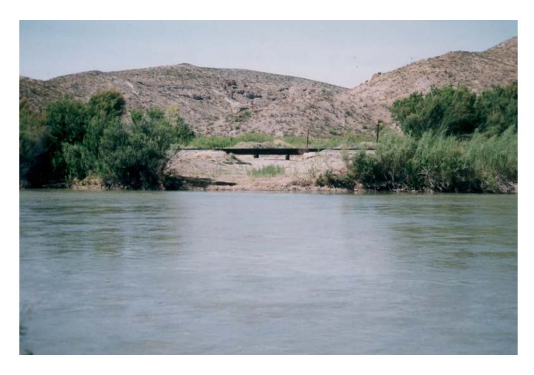
Arroyo : Arroyo confluence with railroad right-of-way. Salt cedar and willows line the river bank.