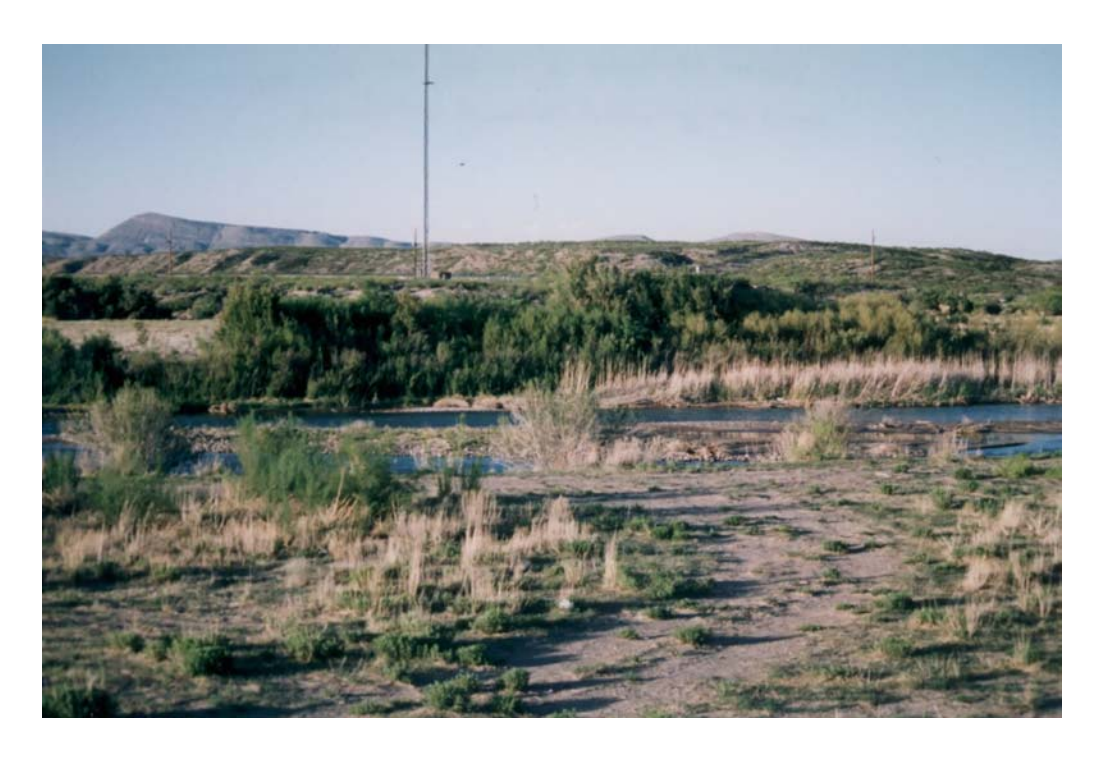
H2 : Well vegetated island wetland on sand bar in the middle of the channel.