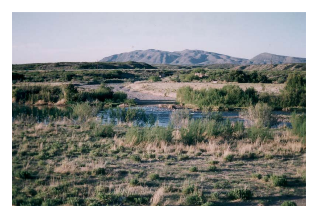
H1 : An arroyo confluence with the river. Surrounding flood plain dominated by salt cedar and bermudagrass. Flood plain on west side of river consists of mostly bare ground.