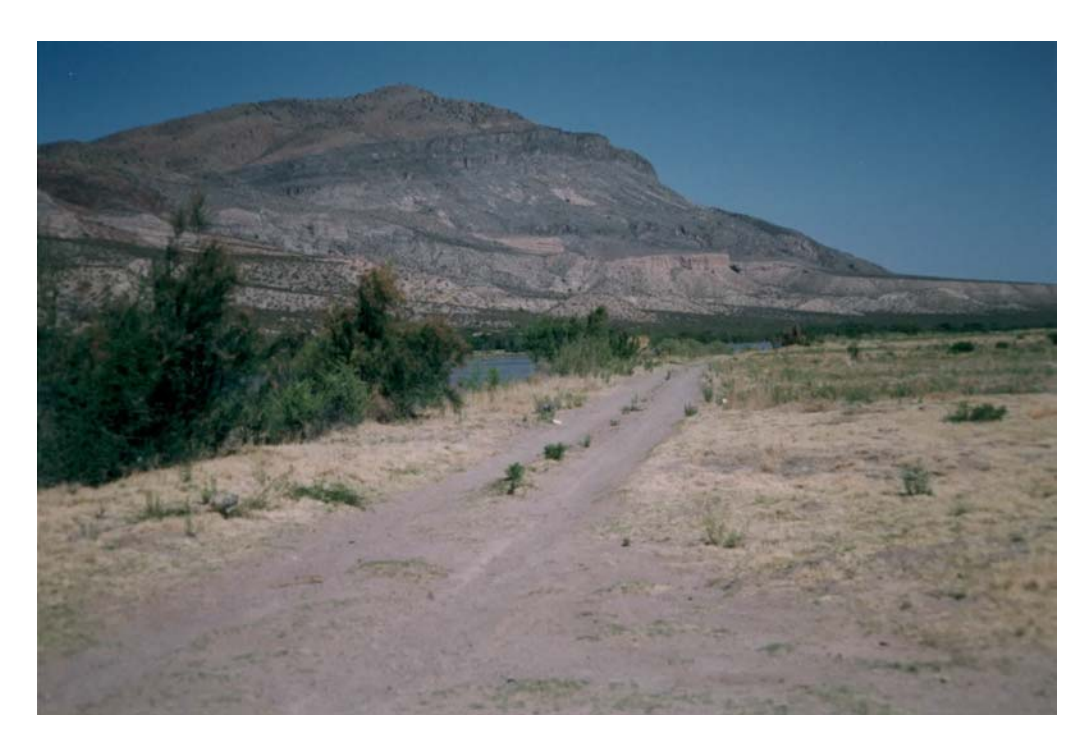
SCL1: Salt cedar lining the river bank. Bermudagrass dominates the flood plain. Relatively wide flood plain.