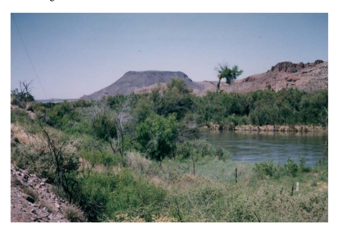
Selden Canyon : Salt cedar community with interspersed cottonwoods and willows.