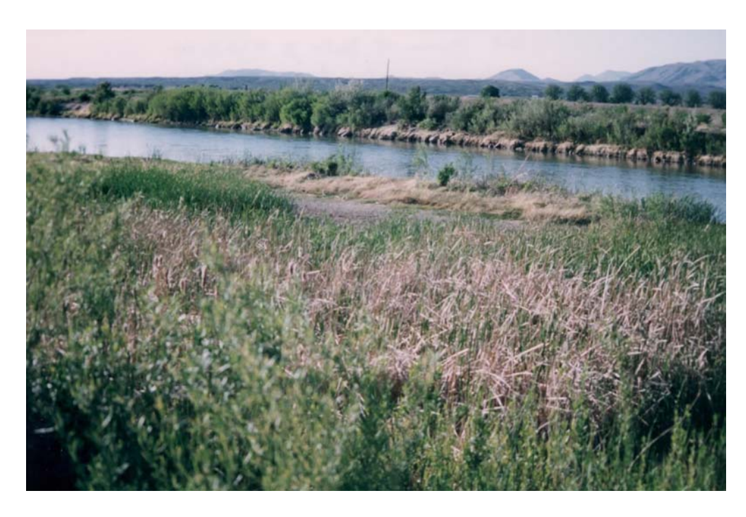
HR2 : Wetlands habitat with volunteer cottonwoods. Vegetated sand bar lines the river.