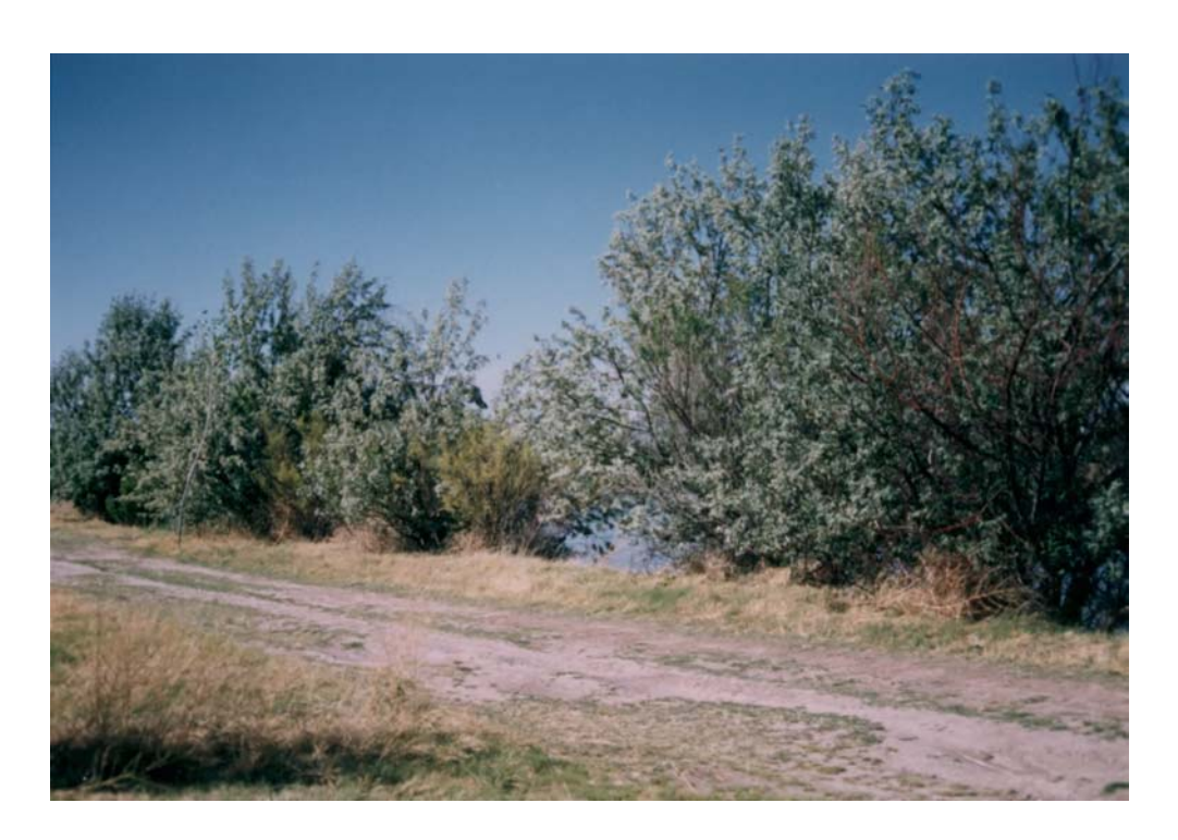
DALC2: Russian olive dominates river bank with few salt cedar intermixed. Cottonwood pole plantings are located in the center of the flood plain. Flood plain is dominated by bermudagrass.