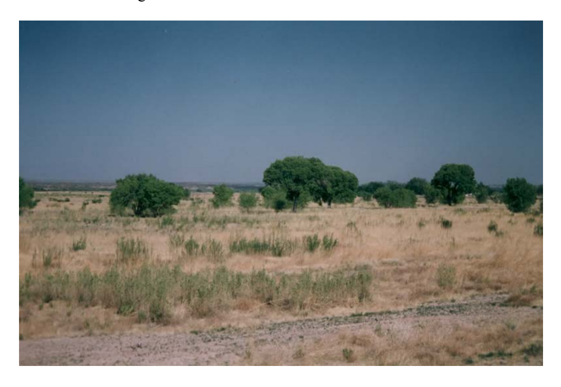
AC1 : Wide flood plain dominated by seep willow, cottonwoods, salt cedar, and sand dropseed.