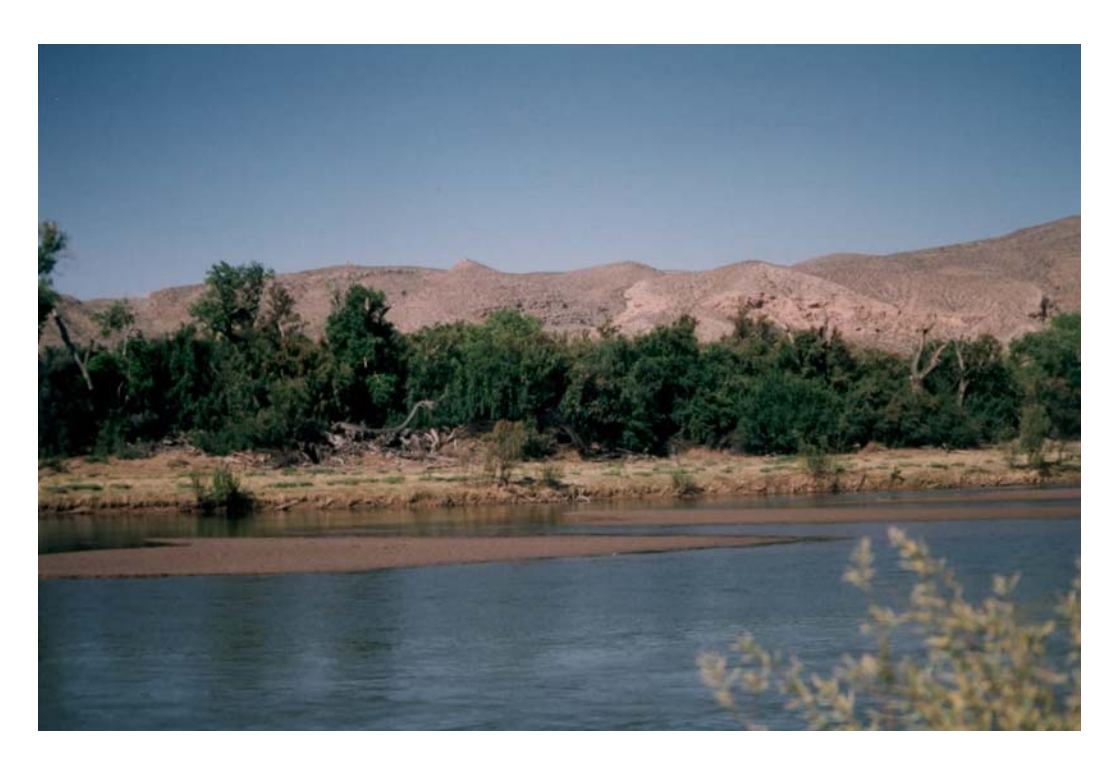
LDA2: West side of river is dominated by salt cedar. Occasional cottonwoods occur. Many snags providing good habitat for cavity dwellers. This site has been severely overgrazed.