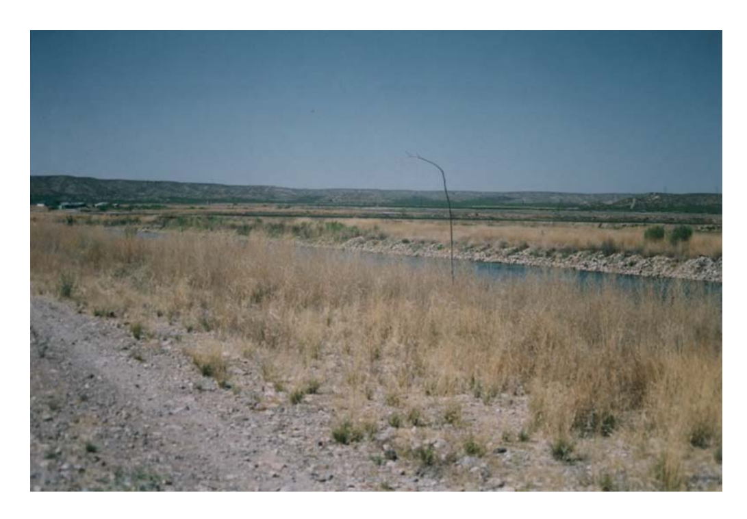
G1 : Armored river bank. Wide flood plain dominated by sand dropseed. Several dead pole plantings.