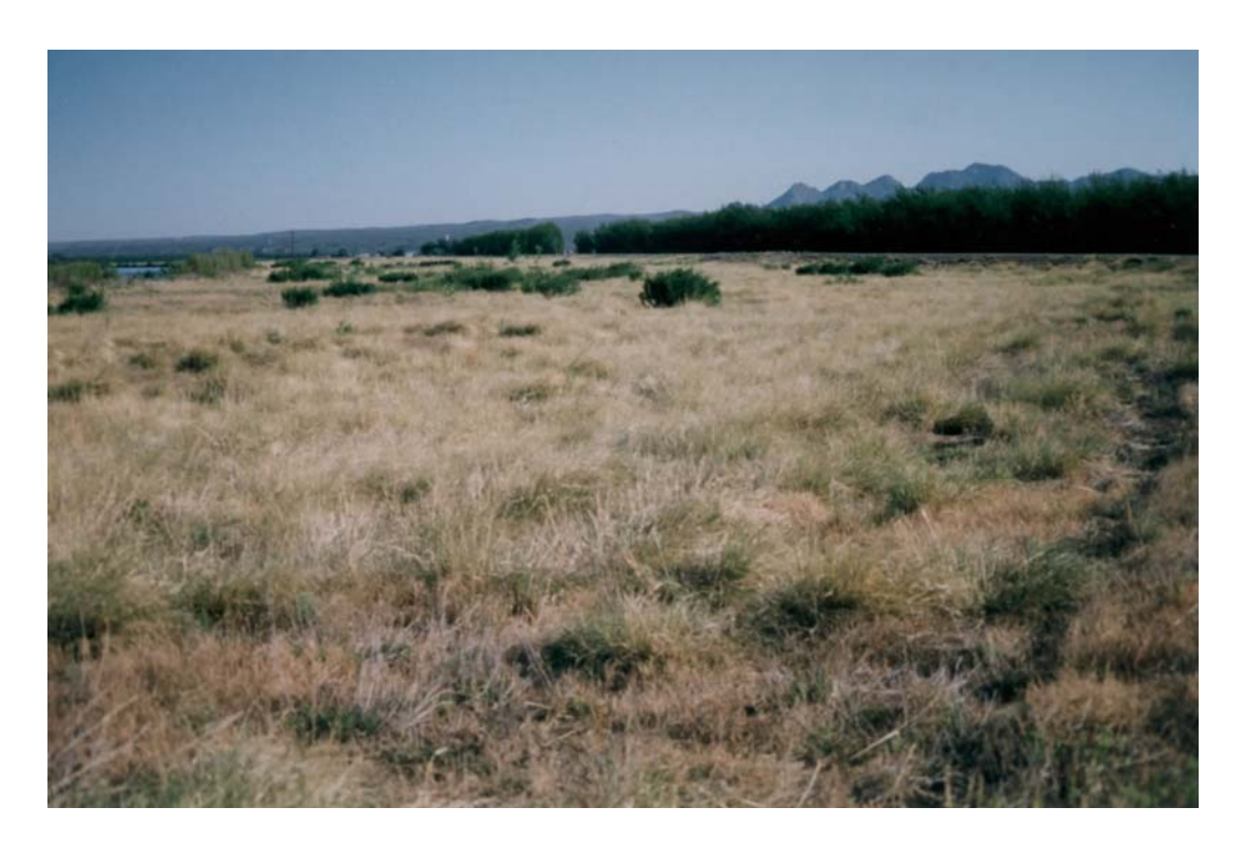
DALC3 : Wide flood plain dominated by sand dropseed ( Sporobolus cryptandrus ). River bank is lined by a narrow band of willows (<5m wide).