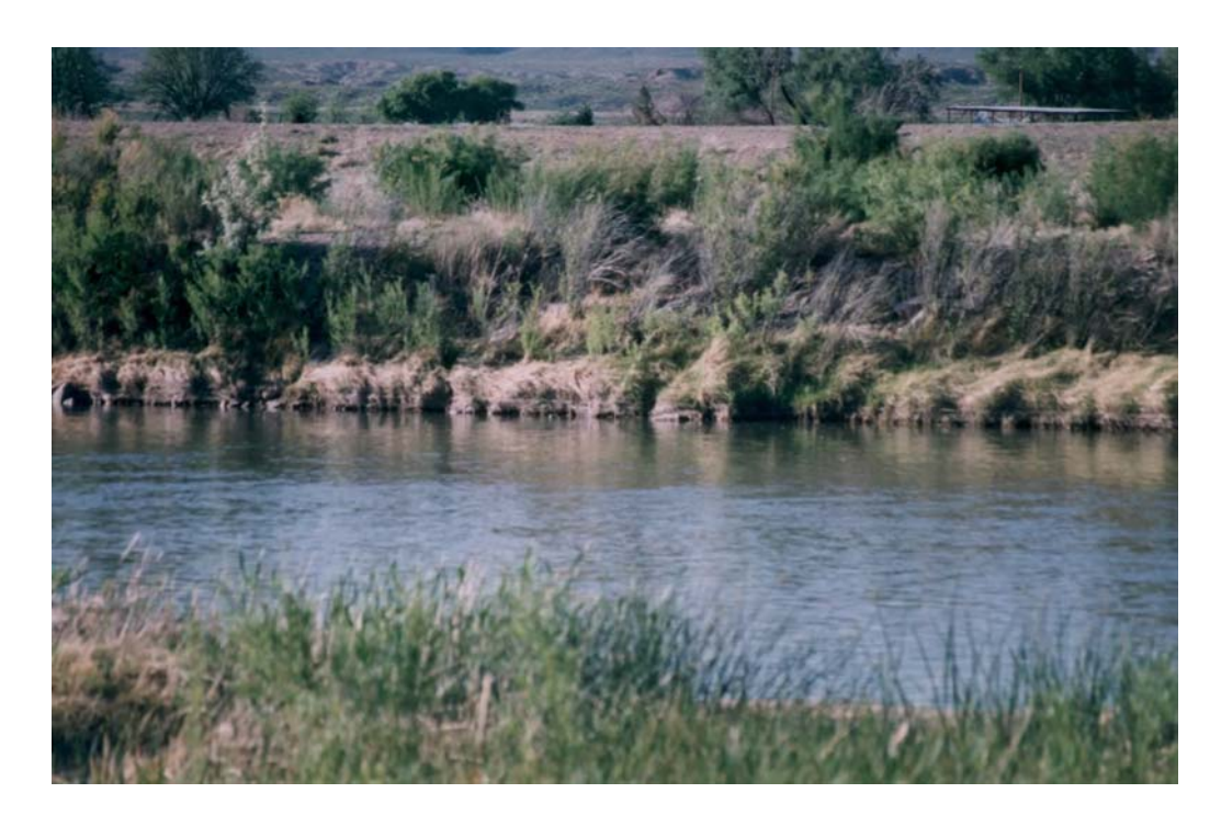
H1: Narrow flood plain that is dominated by salt cedar. Willow and alkali sacaton line the river.