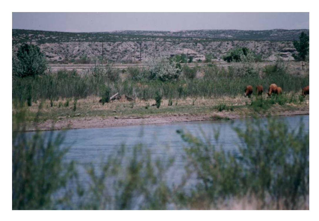
RSA2: Severely overgrazed area that is dominated by salt cedar. Little vegetation to stabilize river bank.