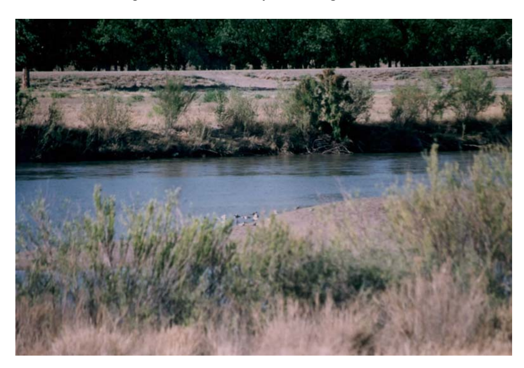
DALC2 : Shore birds (Willets - Catoptrophorus semipalmatus ) utilizing sandbar on the west side of the channel.