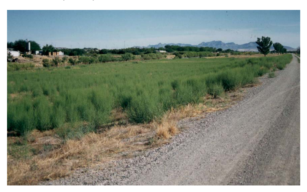
LU2: Area near Vinton Bridge that is dominated by Russian thistle rather than by bermudagrass. A narrow band of willows line the river banks. There is an occasional cottonwood tree at the edge of the thistle community.