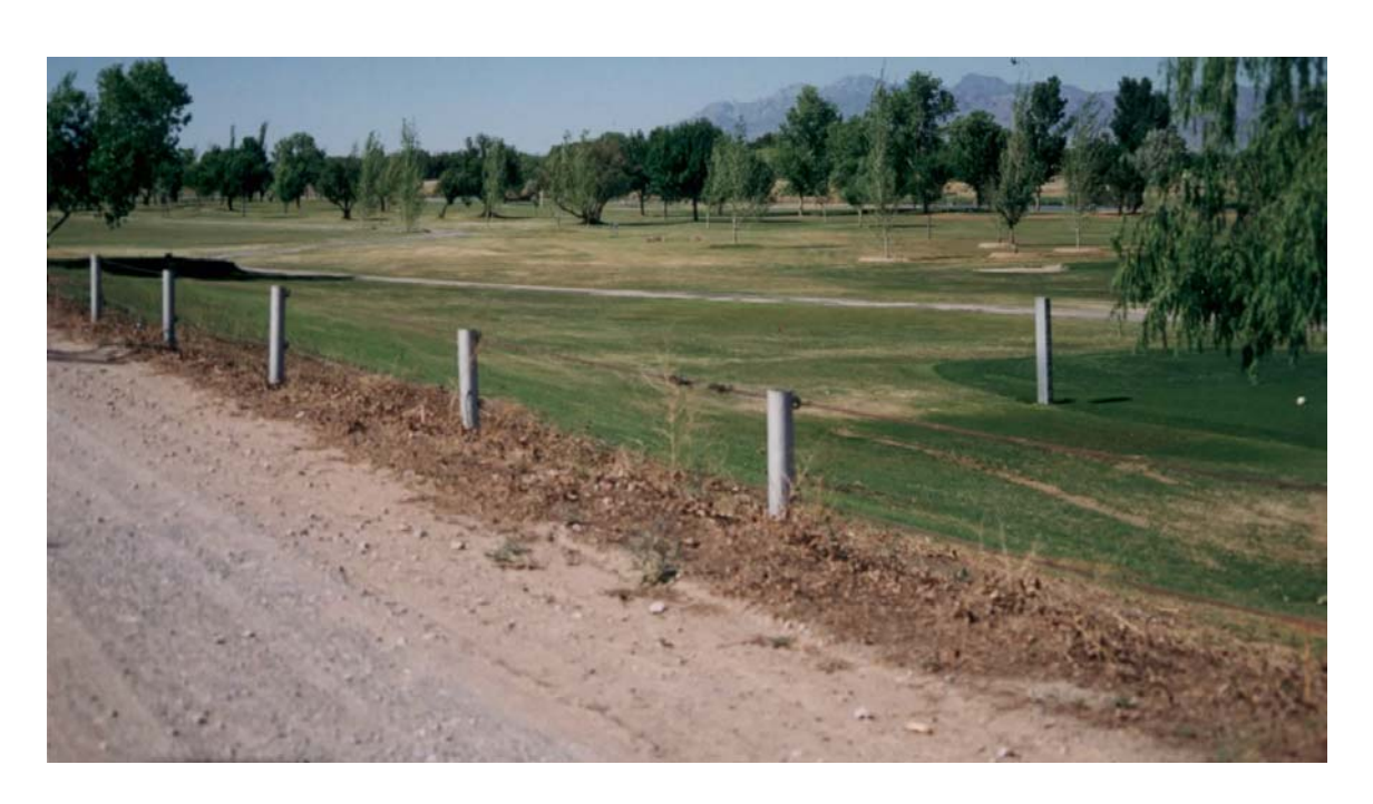
LU1: Anthony Country Club Golf Course