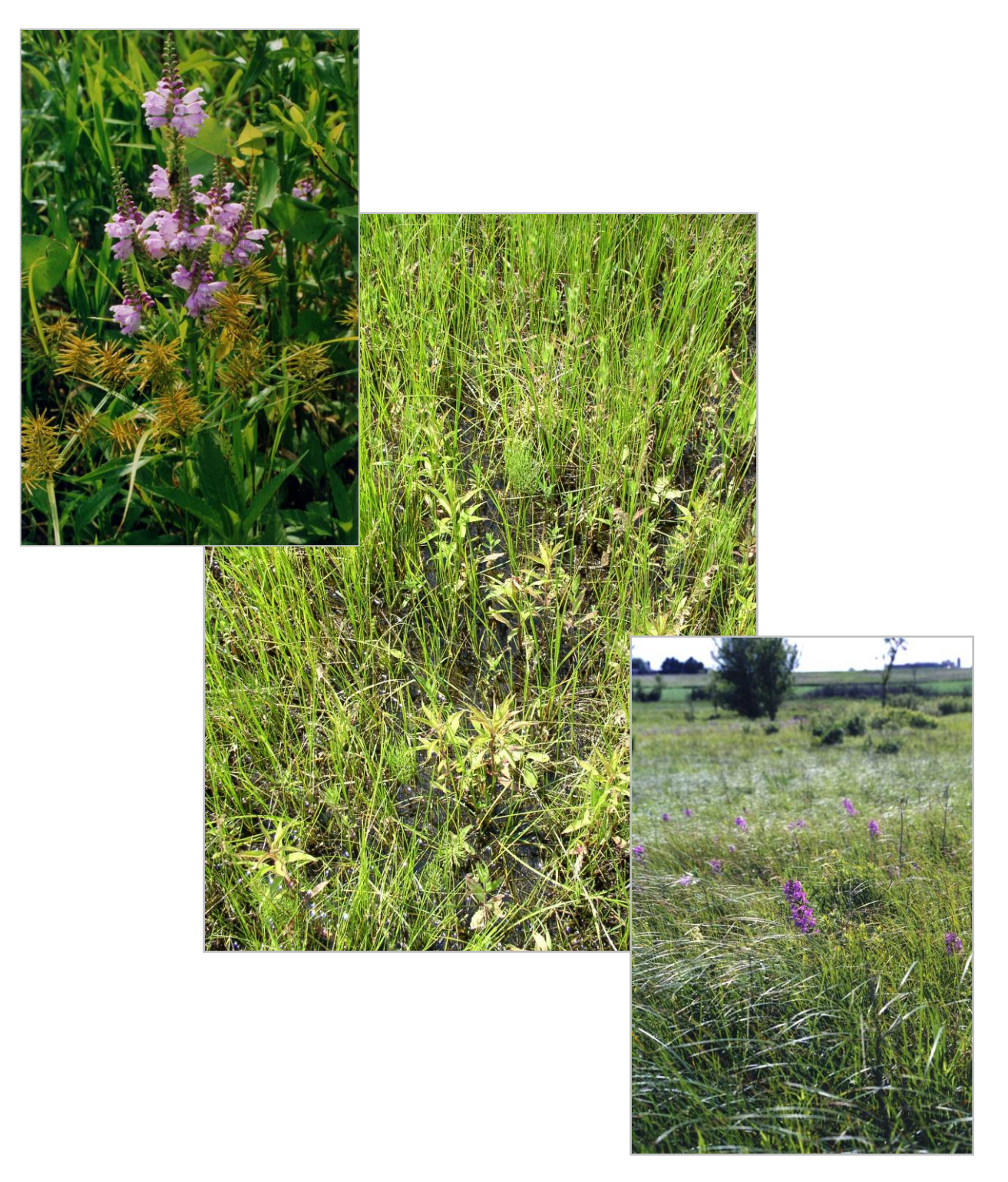
NRCS, Iowa March, 2006