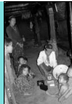
Early morning battery charging in Raje Danda. Photo by DI-H.

The generator consists of a locally manufactured fly-wheel, low RPM DC motor/generator, voltage regulator,