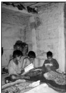
Three older children studying with the light of their 6WLED lamp in Thalpi. The light is seen fixed on the ceiling at the top of the photo.