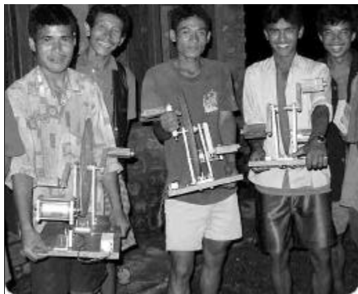
The proud custodians of the Thulo Pokhara Pedal Generators about to take them home.

digital multi-meter, and poly-fibre belt. Each generator was also equipped with an attachable rotating grinding stone, much appreciated for sharpening tools. Also provided was a small chuck, used for holding small carving tools or whatever else the imaginative villagers could think of. The Salop PHG system implementation was relatively straightforward in that the power source already existed and was reasonably well regulated so all that was required was a dependable 220 V AC to 12 V DC converter [5]. The villagers dug all the trenches, laid all the plastic pipes to protect the electrical wiring between the generator and the village and wired their own homes.