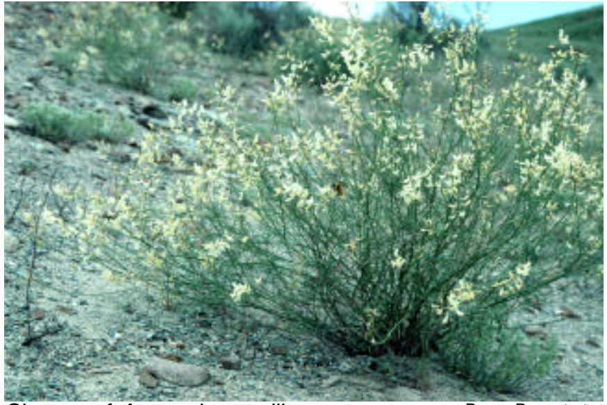
Closeup of Astragalus sterilis