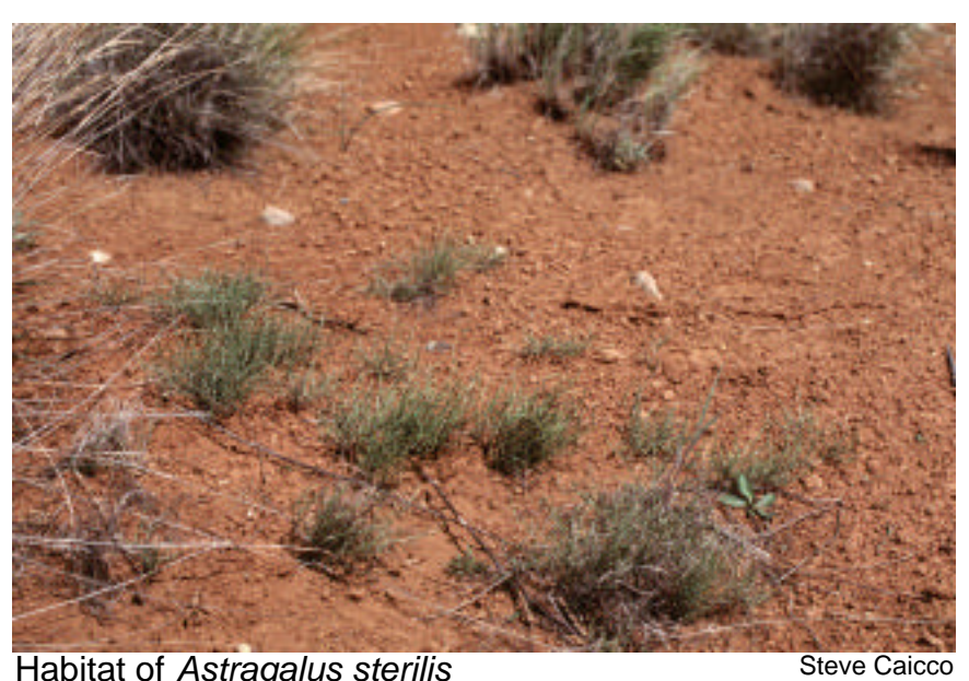
Habitat of Astragalus sterilis