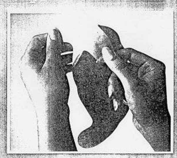
1. Esfregue com a ponta do dedo uma das extremidades do Lib.