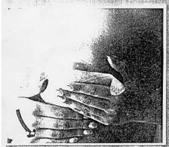
3. Comece aplicando o Lib na altura do mamilo em direção à parte inferior do seio. Você pode ou não cobrir o mamilo. Depende do quão sensual você quer se apresentar.