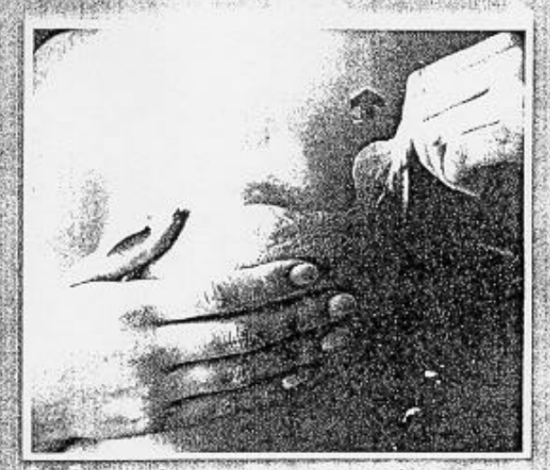
4. Suspenda o seu seio até a altura desejada e fixe as extremidades.