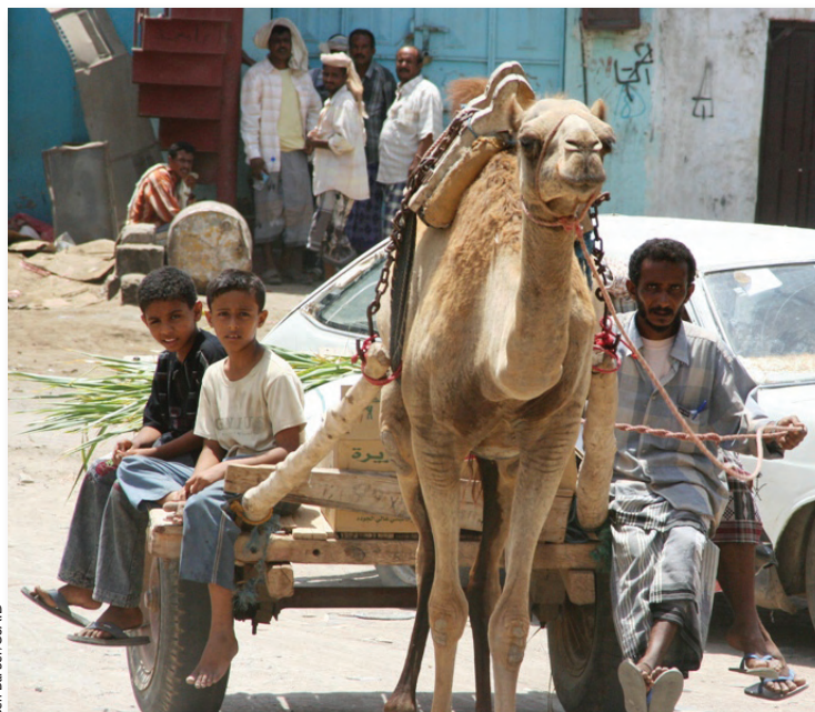
The city council in Jaar, in Abyan Governorate along the south coast of Yemen, has been working with U.S. support to tackle budgets, sewers, education and other issues traditionally handled by the central government. This camel cart was delivering materials to a fish market built by the council with U.S. support. See pages 8-9 for other USAID projects in Yemen.

In addition, in the last year, record food prices have sparked unrest in Guinea, Indonesia, Mauritania, Mexico, Morocco, Senegal, Uzbekistan, and Yemen. ★