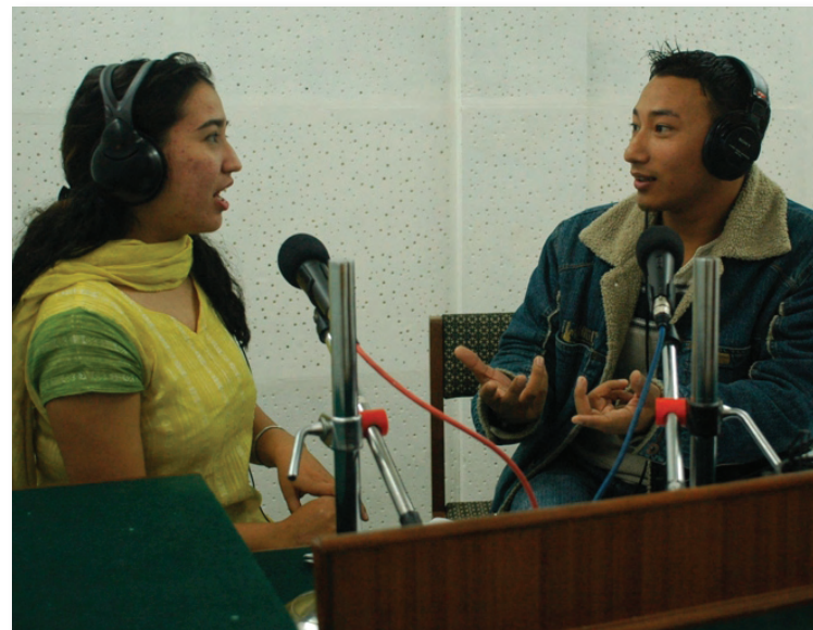
"Chatting with My Best Friend" is being recognized beyond its radio audience of Nepalese youth: the weekly program recently won the 2007 Global Junior Challenge Award, and was featured on CNN.

The national broadcaster, Radio Nepal, airs the program every Saturday, and it is rebroadcast by more than two