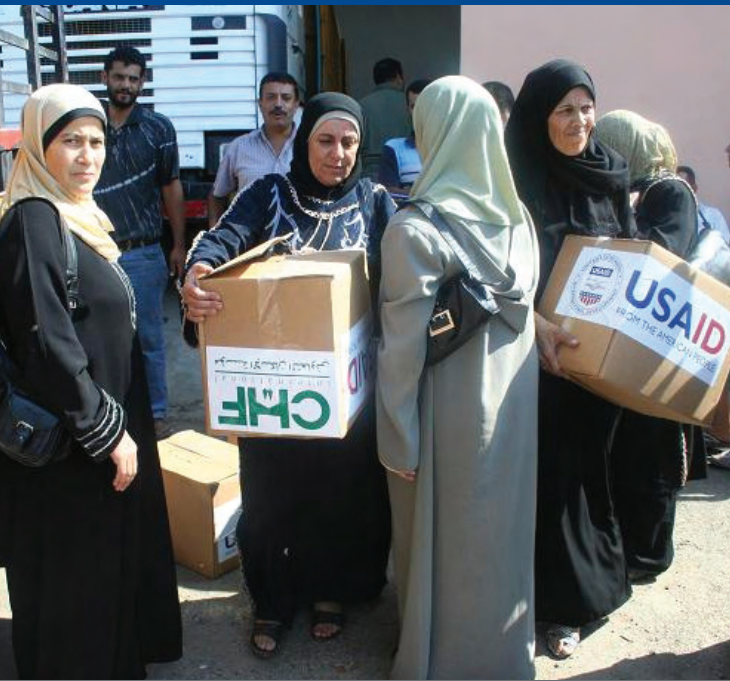
Women from a local community in Lebanon receive food baskets.

Fishermen in the area lost most of their fishing nets and tools, with more than 300 boats needing extensive renovations. Farmers were unable to work their land and lost their crops. Most of the small businesses, including the local