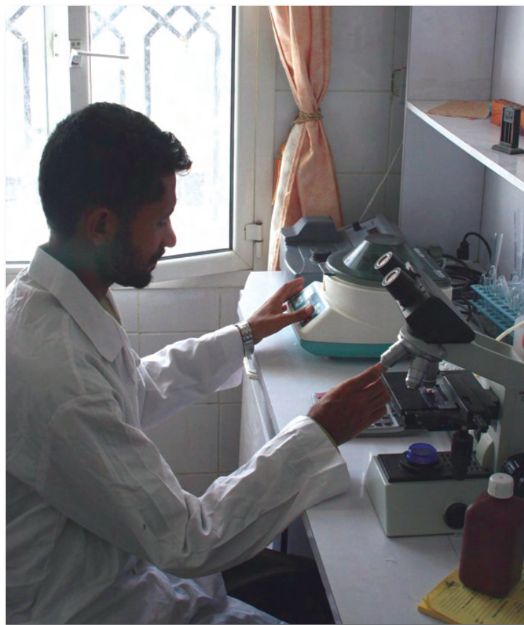
A technician works with medical equipment provided by USAID to a district hospital in Yemen's Marib Governorate.