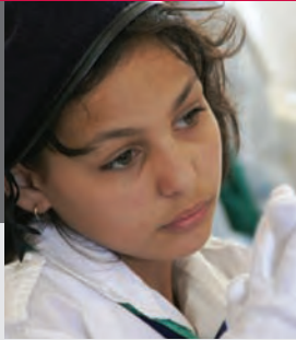
A girl attends a school in southern Lebanon that received computers, desks, and kitchen equipment from USAID.

See page 3 to learn how food was distributed to a Lebanese conflict zone.