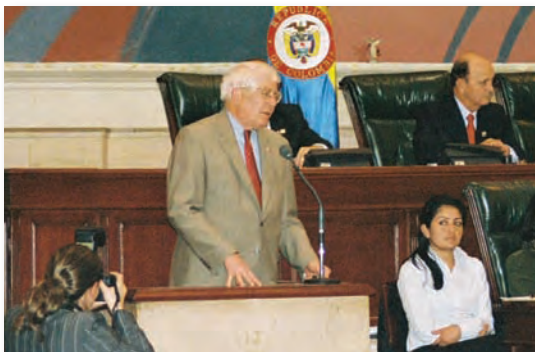
Rep. David Price (D-N.C.), chairman of the House Democracy Assistance Commission, addresses a session of the Colombian Congress.

The commission provides technical expertise to enhance accountability, transparency, independence, and government oversight in the legislatures of these countries. For example, in Macedonia, Kenya, and Haiti, U.S. members of Congress and their staffs acted as trainers in Agency legislative programs.