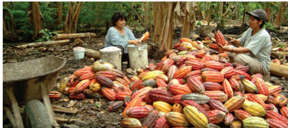
In the depths of the island of Pongo in Chazuta, a remote jungle area in the San Martín region in northeastern Peru, two former cocalero women cut open cacao pods for the sun-drying process to prepare the beans for organic chocolate production.

The Agency also has specific programs aimed at schools and health programs, prioritized by regions that have eradicated their coca. And a democracy program contributes to the program by working with local governments in the coca-growing areas. Resources are used for training and technical assistance to strengthen regional and municipal governments, improve staff, and expand responsibility and accountability. ★