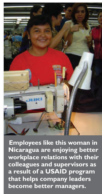
Employees like this woman in Nicaragua are enjoying better workplace relations with their colleagues and supervisors as a result of a USAID program that helps company leaders become better managers.

managers and workers to identify and resolve gaps in compliance issues such as forced overtime, improper health and safety practices, communication, and maternity leave. In so doing, factories aim to become compliant with their respective national legislation and the International Labor Organization's Core Labor Standards, and to increase worker morale and productivity.