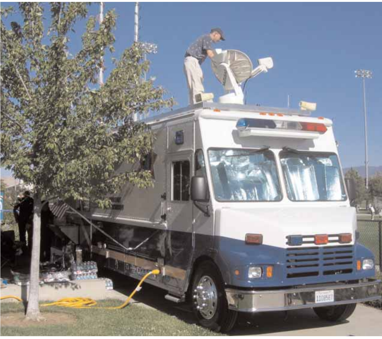
LIVERMORE POLICE DEPARTMENT'S Community Outreach Vehicle served as the command post for the city's Fourth of July celebrations and was the primary monitoring location for LPD and Sandia staff involved in the SMA testing.

that will arm first responders with the information and technical infrastructure necessary to take action quickly and effectively. Any number of special events, both large and small, could benefit from such a system, she says.