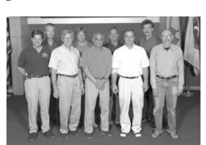
Z-DYNAMIC HOHLRAUM Inertial Confinement Fusion Team (not all team members shown).

They will be among teams and individuals from across Lockheed Martin's business sectors who will be honored in a special ceremony at the National Air and Space