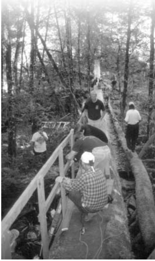
National Public Lands Day volunteers in the Eugene (OR) District worked to construct a footbridge at the McGowan Creek Environmental Education Area, northeast of Springfield.

Groups of all sizes, partner organizations, and other volunteers contributed thousands of hours to BLM in Oregon in 2001. As in previous years, volunteers played a major role in many different program areas. The Umpqua Training and Employment Program and Experience International provided hosted workers to the Roseburg District for the wildlife, fisheries, and hydrology programs. In the Eugene District, six members of the