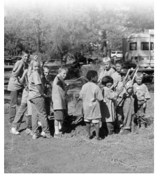
The volunteer spirit of the next generation was evident during National Public Lands Day at the Gerber Recreation Site near Klamath Falls, Oregon. Young volunteers planted trees and helped with other tasks.

Roadside eyesores received volunteer attention in 2001, and so did specific BLM sites, such as the National Historic Rogue