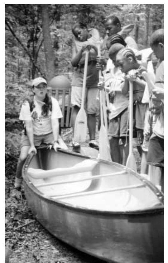
Take me to the river....Paddles ready and life vests on, campers at the Crow's Neck Environmental Education Camp in north Mississippi learned canoeing do's and don'ts from one of the camp's volunteer staffers.

Vicksburg, Mississippi, in addition to being great volunteers, were featured on Animal Planet's, "A Pet Story." The 30-minute episode began airing nationally in April and continues as a rerun once or twice per month. It has been a very popular show and a tremendous promotional tool for the BLM's Adoption Program.