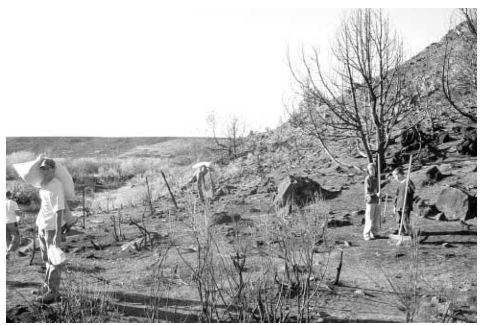
Boy Scout Troop 105 from Buhl, Idaho, spent 2 days hand-raking seed to stabilize soils along 1.5 miles of Clover Creek. The area had burned during the 2001 Doe Flat fire.