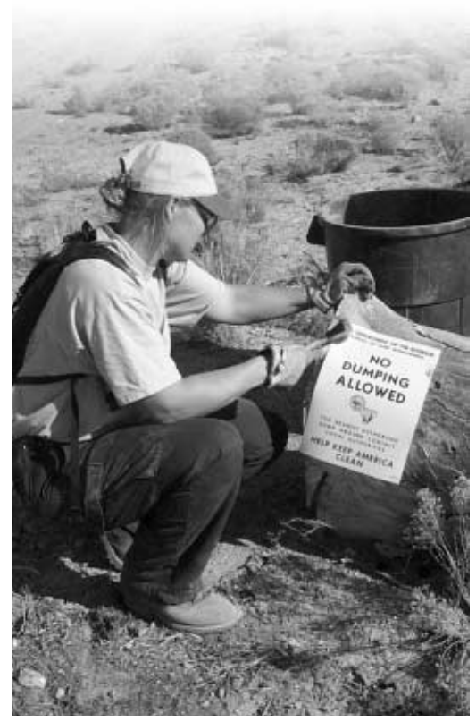
In observance of National Public Lands Day, the Socorro, New Mexico, Field Office sponsored a cleanup of the Teypama Pueblo Ruin. The ruin is listed on the National Register of Historic Places.

involvement with cave management projects and resource protection has enabled BLM to keep up with the demands of managing the cave program. These cavers have discovered and surveyed over 200 caves on the public lands in east-central and southeast New Mexico. The locating, cataloging, and inventorying of these caves has been a tremendous help to the BLM and its resource management