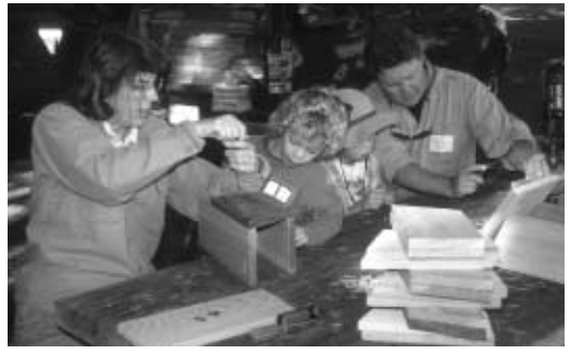
Volunteers of all ages turned out for National Public Lands Day at Schwartz Park in the Eugene (OR) District. In addition to building bird boxes, volunteers also helped improve trails and repair signs.

areas along the Rogue River corridor. The total garbage intake for the cleanup effort was 50 cubic yards of trash (about 5 dump truck loads) and 300 tires. The event was capped off by a free barbecue and musical entertainment near the Rand Recreation Site. River cleanup partners, including local river recreation companies, donated 50 door prizes, which ranged from small, river gear bags to overnight stays at lodges along the Rogue.