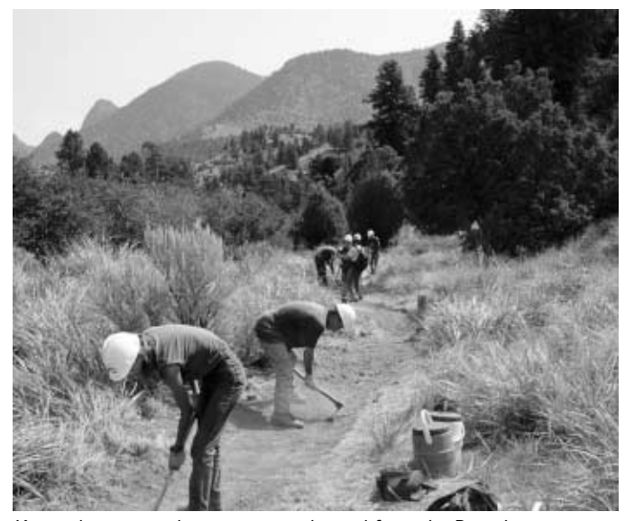
Kremmling area volunteers created a trail from the Pumphouse Recreation Site, east along the Colorado River towards Gore Canyon.

ATV Quad Dusters, one of Colorado's active volunteer groups, participated in many volunteer projects during the reporting period, including National Trails Day, National Public Lands Day, and numerous