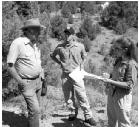
During the summer of 2001, Student Conservation Association interns assisted rural homeowners in developing techniques for protecting their homes from wildland fires. Seven interns completed over 350 individual home assessments.

With over one million visitors each year, Red Rock Canyon National Conservation Area (NCA), located just outside of Las Vegas, is one of the top visitor sites in Nevada. Much of this is made possible by the