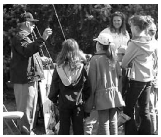
Kids Fishing Day in Miles City, Montana, found many eager anglers lining up to learn the fine points about fishing. Many partners played a big role in making the event a success, providing everything from instructors to prizes.

In 2001, a group Volunteer Agreement was signed between the BLM Dillon Field Office and the Montana Youth Challenge, a program geared toward juveniles at risk