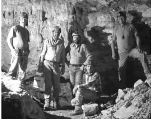
As they have for many years, New Mexico cavers contributed hours and expertise to the BLM in 2001, discovering new caves, mapping others, and performing countless other important tasks. The Southwest Region of the National Speleological Society, a few of whose members are seen above, was honored for its efforts at the "Making a Difference" Awards ceremony for 2001.

In the Roswell Field Office area, biological resources were the beneficiary as Conservation Good Turn took place at Fort Stanton in March. Nearly 300 Cub Scouts, Boy Scouts, and leaders from the Conquistador Council