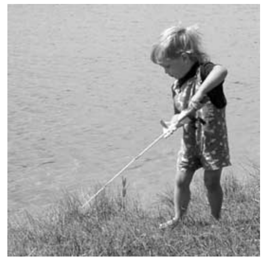
Reeling in a big fish is a serious proposition, as even the youngest anglers know. The Miles City, Montana, Field Office held its 10th annual Fishing Week event in 2001, with help from many sponsors and community partners.

laws, kept the area free of litter, and gave helpful information to public land users.