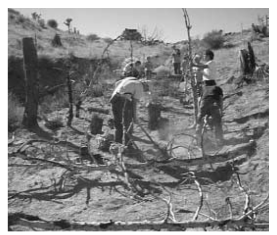
In an attempt to reduce erosion and prevent illegal off-highway vehicle travel in the Juniper Flats burned area near Barstow, California, volunteers "planted" dead tree limbs and brush in the wide open areas-a technique called "vertical mulching."

BLM initiated its "Making a Difference" National Awards in 1995, holding its first recognition ceremony in 1996. This year's observance marked the seventh annual presentation of these awards.