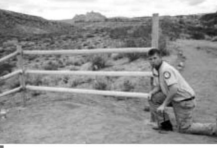
Volunteers from Americorps worked with the St. George, Utah, Field Office on fence-building, kiosk construction, and other projects.