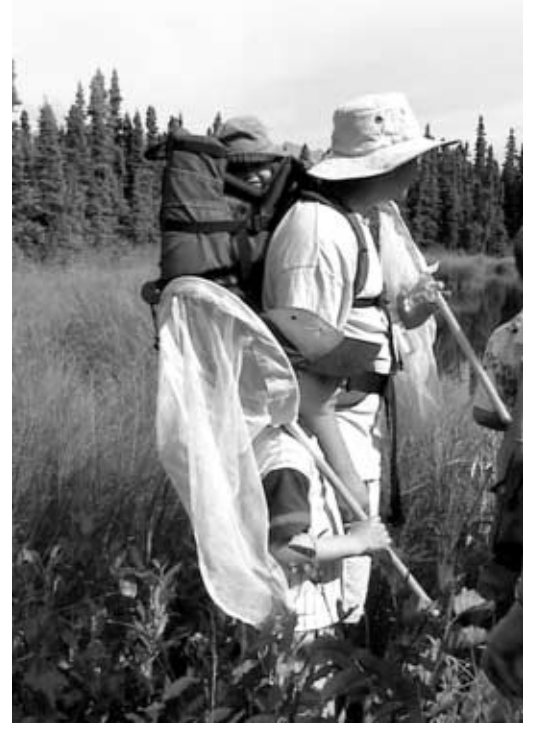
You're never too young to volunteer! Volunteers of all ages came out to survey the butterfly population of the Anchorage area. The Fourth of July Butterfly Count is the only such count of its kind in Alaska.

Talented and dedicated volunteers continue to contribute many hours to the BLM in Alaska. Again in 2001, one of the major beneficiaries of volunteer time and talent was the Campbell Creek Science Center in Anchorage. Hosted workers helped to lead family-friendly outdoor science workshops, conduct science lectures, and direct a volunteer naturalist training program as well as a disability