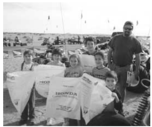
Why clean your room when you can help clean the dunes? Youngsters and their parents participated in the annual cleanup of the Imperial Sand Dunes Recreation Area near Glamis, California.

On March 24, 2001, over 225 off-road racers, families, and friends of BLM Park Ranger Jack Waldron showed up to help in the Inaugural Jack Waldron Memorial Cleanup. They were successful in collecting over 86 tons of trash and four abandoned car bodies, leaving the Barstow OHV area a much