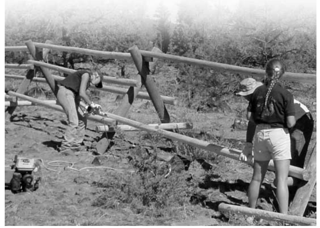
National Public Lands Day 2001 was a busy day in Oregon. At the Gerber Recreation Area near Klamath Falls, volunteers were involved in many projects, including buck-and-pole fence construction.

for the present and the future while considering both local and national concerns. Volunteers help to make this possible. From energy and minerals to plants and wildlife, from recreation to cultural and historical resources, volunteers serve across the spectrum of BLM programs. They donate their time as individuals, couples, and groups. Some participate in day-long events, while others provide years of service. No matter where or for how long they serve, volunteers also serve as examples for all citizens—not only taking pride in our nation's public lands, but taking action as their stewards.