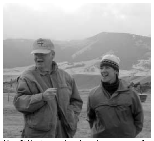
Many BLM volunteers love the wide-open spaces of the West. Just ask the Moores, campground hosts at Red Mountain campground near Dillon, Montana.

The original CCC movement under President Roosevelt recruited approximately 2 million Americans from 1933 to 1942 to conserve natural resources across the nation. The recruits, mostly young men between the ages of 17-21, planted more than 3 billion trees, surveyed and mapped lands, dug wells, built dams, and completed soil erosion control projects. The CCCers were paid approximately $30 a month for their efforts.