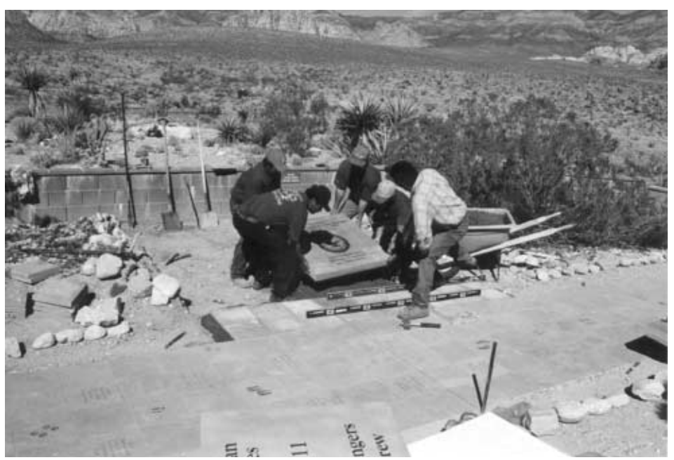
On National Public Lands Day 2001, BLM and two partner groups—the Friends of Red Rock Canyon and the Red Rock Canyon Interpretive Association—dedicated a memorial to the victims of September 11. The 300-pound memorial stones are made of metaquartzite, which was excavated from a quarry near Goodsprings, NV.

"Living with Wild Horses" is a program designed to help BLM manage wild horses that drift out of the Pine Nut Mountain Herd Management Area (HMA) onto private lands in Carson City and Douglas Counties. The BLM, Carson City Field Office, and the Pine Nut Wild Horse Posse, a private group of