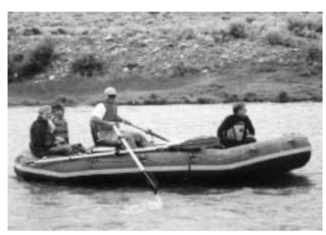
In celebration of National Public Lands Day, the Cody, Wyoming, Field Office hosted the Shoshone River public lands cleanup. Wintry winds were already blowing, but volunteers managed to complete several projects, including litter pickup, sign and nest box installation, and trail maintenance.

Volunteers in groups and as individuals made major contributions to BLM in Wyoming in 2001. The BLM Cody Field Office hosted five Student Conservation Association (SCA) interns to implement a pilot project for community education and outreach about invasive plants and noxious weeds. The student interns worked in conjunction with the BLM, community groups, and other state and federal agencies to spread the word about noxious weeds. A few of the notable accomplishments included participating in the Park County Fair, teaching community education classes, developing a display explaining the potential effects of weeds on wildlife for the Buffalo Bill Dam Visitor's Center, developing and presenting youth education in classrooms, and writing numerous articles for local newspapers.