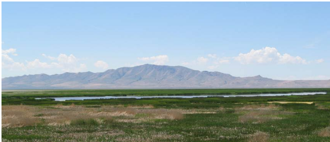
TNC Layton Marsh, Davis County