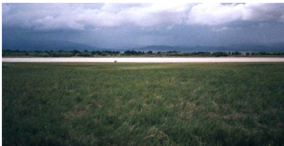
Goshen Playa, Utah County