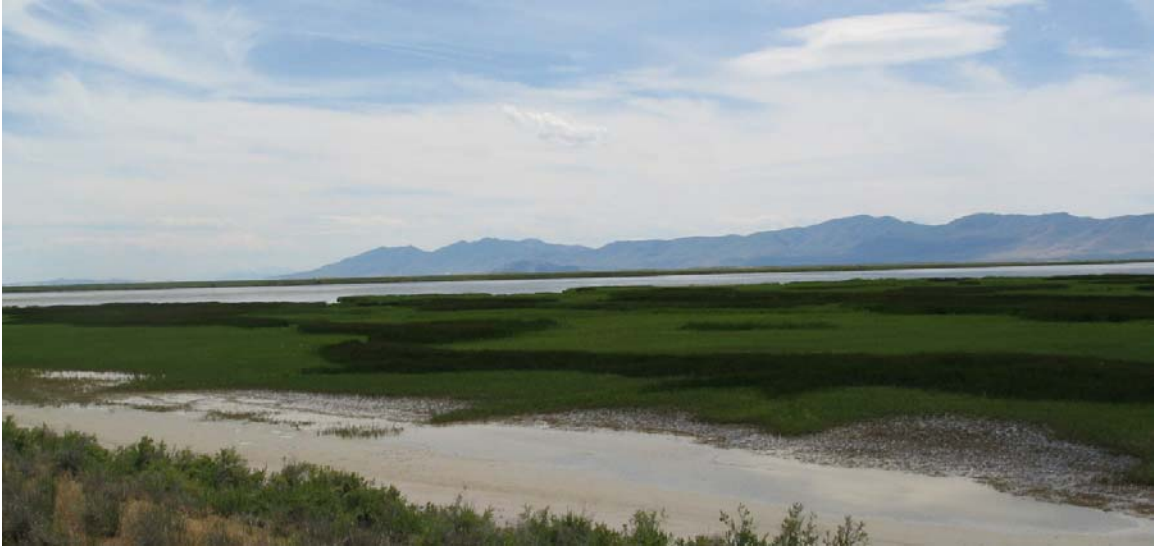
Widgeon Marsh slope complex, managed, Public Shooting Grounds, Box Elder County