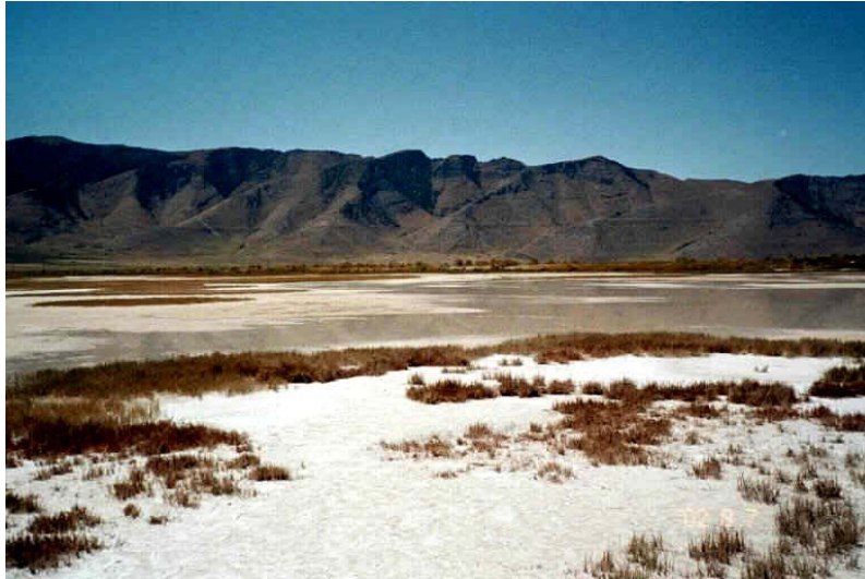
Plover Playa, Tooele County