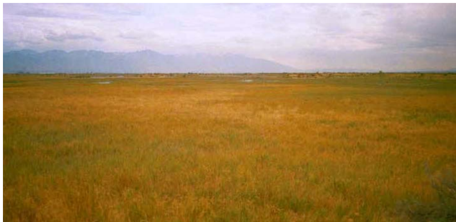
Salt Lake Airport, Salt Lake County