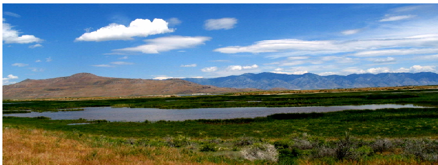
South of Hull Lake, Public Shooting Grounds, Box Elder County