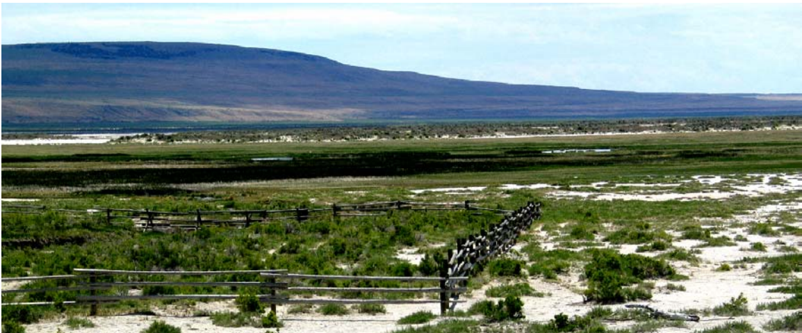
Salt Wells Meadow, Box Elder County