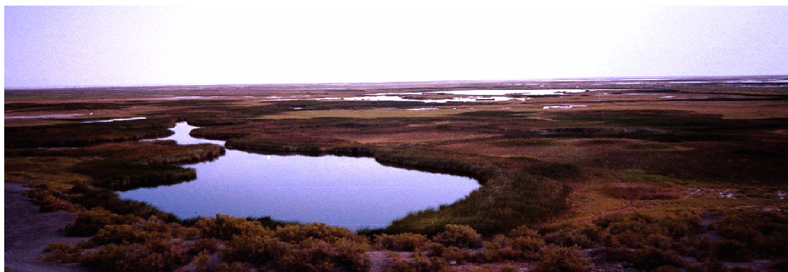
Blue Lake Slope complex, Tooele County