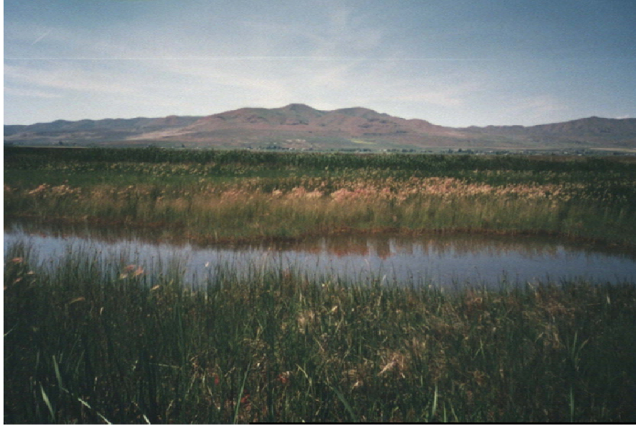
Salt Creek WMA, Box Elder County