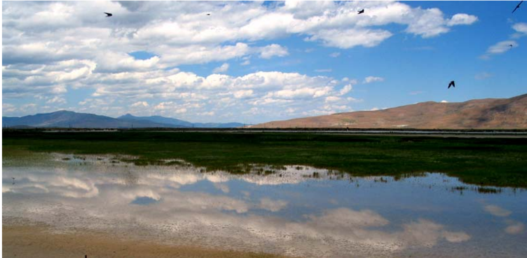
Duck Playa – Public Shooting Grounds