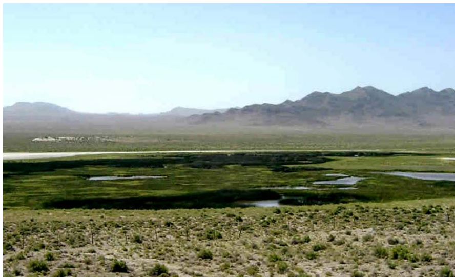
Leland Harris Complex, Juab County