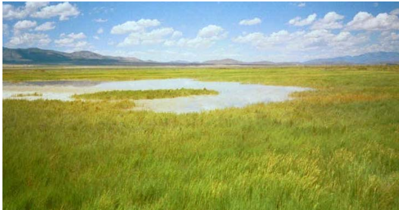
South of Goshen, Utah County