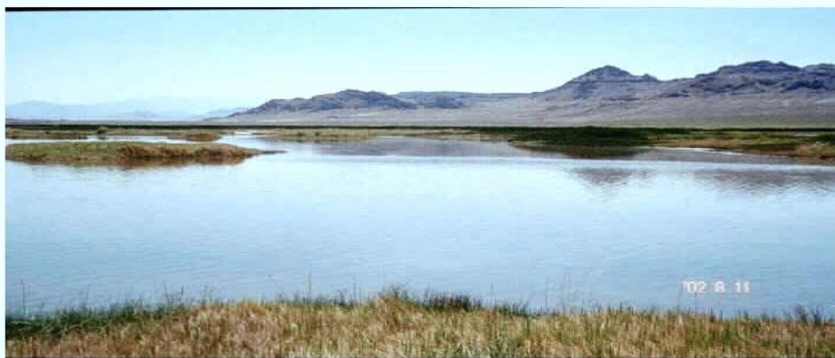
Pond in Blue Lake Complex, Tooele County