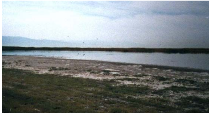
Playa on The Nature Conservancy Layton Marshes at 4205 ft. It has had water 2 of the last 8 years, water was overflow from GSL.