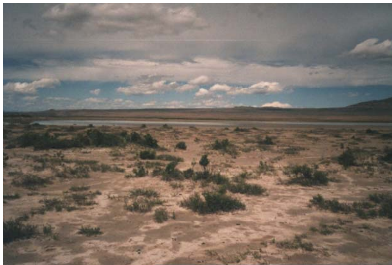
Salt Wells Playa, Box Elder County