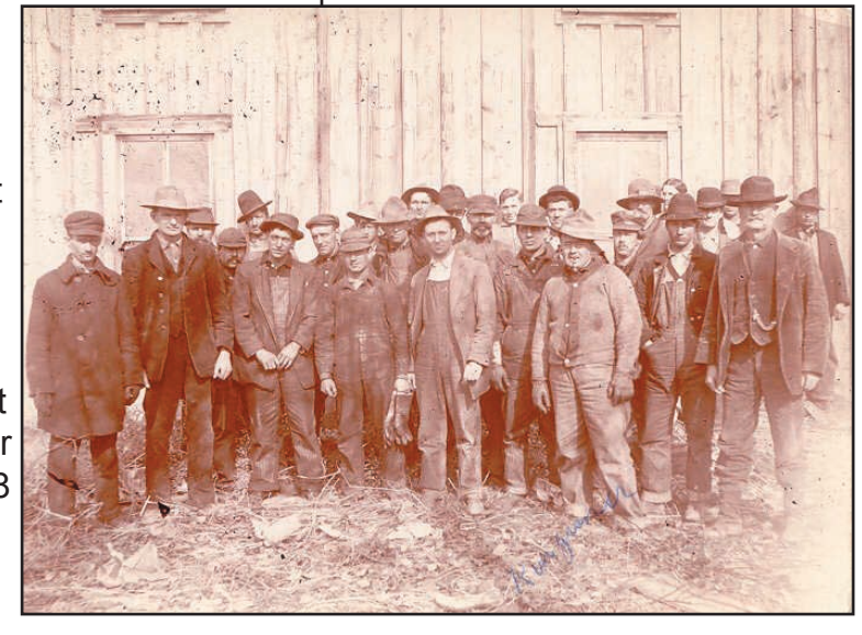
Work crew that helped construct Deer Flat Reservoir.