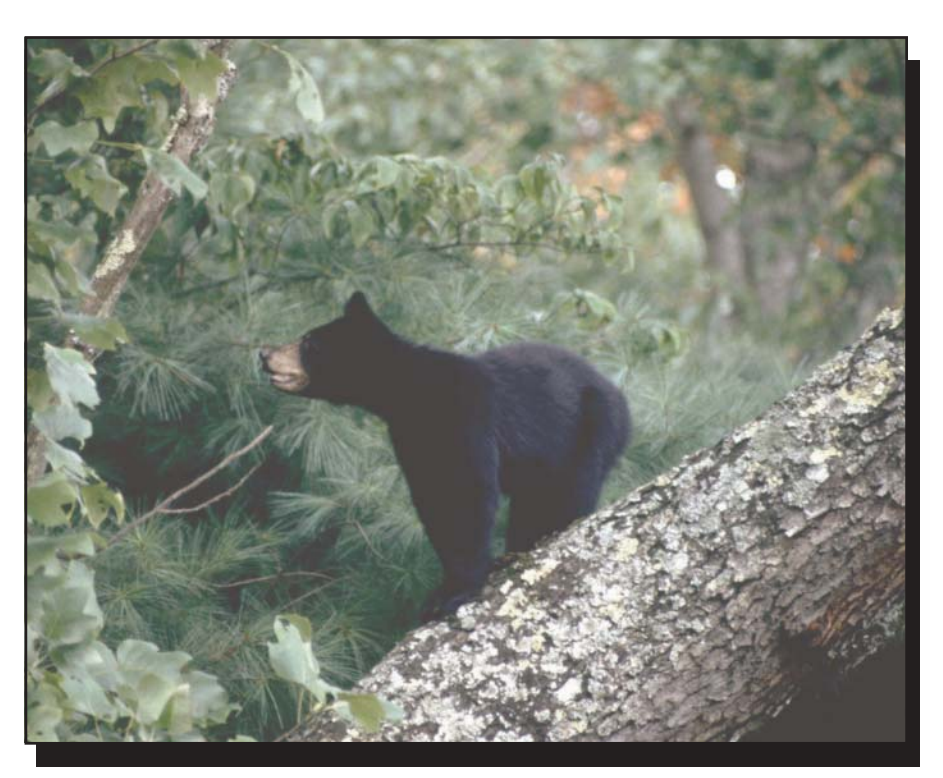
Figure 1—Black bears strip the bark from trees to eat the sapwood.

Tree species stripped by bears vary depending on the location, probably reflecting the species available. In the Pacific Northwest, bears frequently girdle (strip bark all the way around the trunk) of Douglasfirs, primarily immature smooth-barked trees ranging from 15 to 30 years old. Girdled trees die because they cannot transport nutrients from the branches to the roots. Trees of any age are vulnerable to bear damage. Although western hemlocks are sometimes stripped, they are stripped earlier in the year and are stripped less frequently once Douglasfir trees break dormancy. Bears appear to prefer redwoods in northern California, western red cedar in British Columbia, and western larch in interior forests. Other species reported to have been stripped by bears include silver fir, balsam fir, grand fir, subalpine fir, noble fir, bigleaf maple, red alder, western larch, Port Orford cedar, Engelmann spruce, white spruce, red spruce, Sitka spruce, whitebark pine, lodgepole pine, western white pine, aspen, black cottonwood, bitter cherry, willow, and northern white cedar.