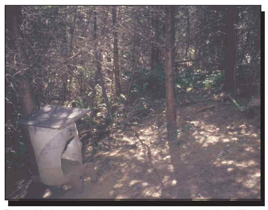
Figure 3—A feeding station that dispenses pellets with a high concentration of sugar. When they had the opportunity, bears tended to feed on pellets rather than strip bark from trees.

Feeding Stations—Most forest managers in western Washington use similar approaches when feeding bears. Feeding stations (figure 3) are constructed from 55-gallon (250-liter) metal or plastic drums. An opening in the front provides access to pellets. A simple self-feeding delivery system prevents bears from spilling pellets. A foam-insulated plywood roof keeps pellets dry. A single feeder holds about 90 kilograms of pellets. Commercial pellets are about 0.6 centimeter in diameter and 1.3 centimeters long. They resemble dry commercial dog food, but are greenish. The sugar concentration in pellets is high (about 20 percent) and