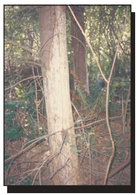
Figures 2a and 2b—Douglas-fir trees peeled by a black bear feeding on sugars in the newly formed wood beneath the bark.