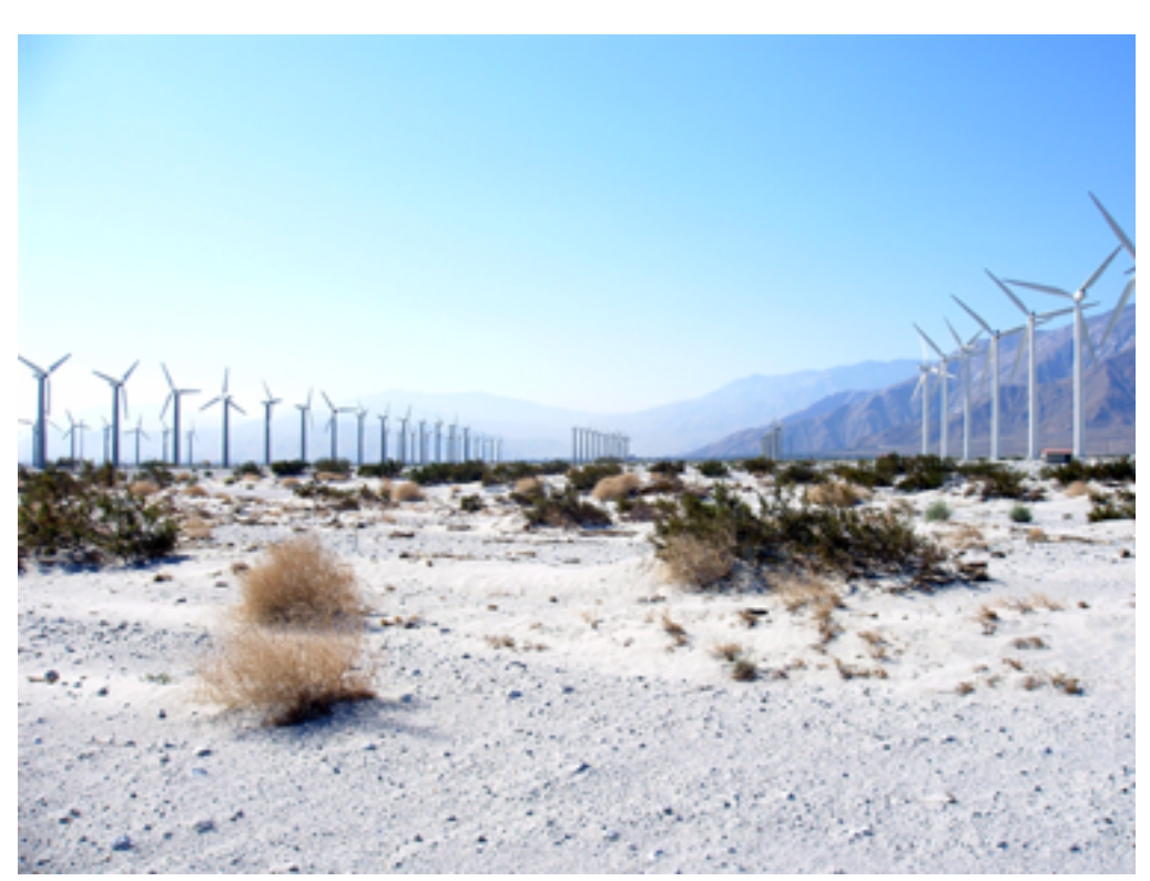
Photo 2. Looking south along the alignment. Mix of Carsitas gravelly and cobbly soils.