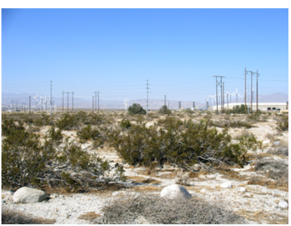
Photo 4. Substation site on Carsitas fine sand. Plant community is creosote bush scrub.

November 8, 2006 Seawest Powerline SEA05-101