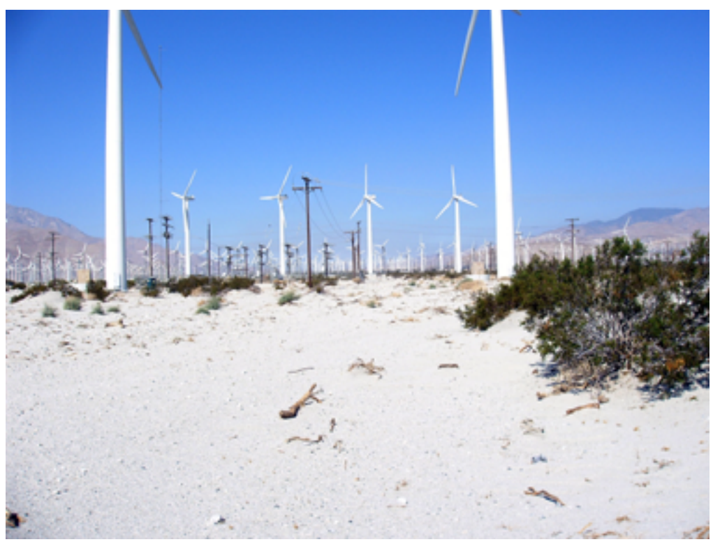
Photo 3. Looking west from pole line. Soil is Carsitas fine sand. Note the buildup of sand hummocks around the creosote bushes.