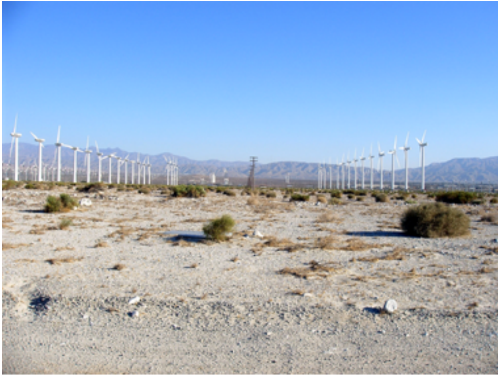
Photo 1. Alignment of powerline line from the south. Soil is Carsitas cobbly sand. Note sparse shrub cover.