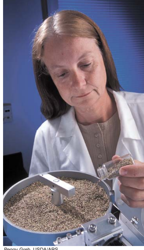
Peggy Greb, USDA/ARS

Consumer acceptance of GE crops in the European Union did not become a major issue until 2000. Source: Applications from private firms to USDA's Animal and Plant Health Inspection Service for field trials of biotech seed. Seed sales are ERS estimates based on seed use and prices paid by farmers.