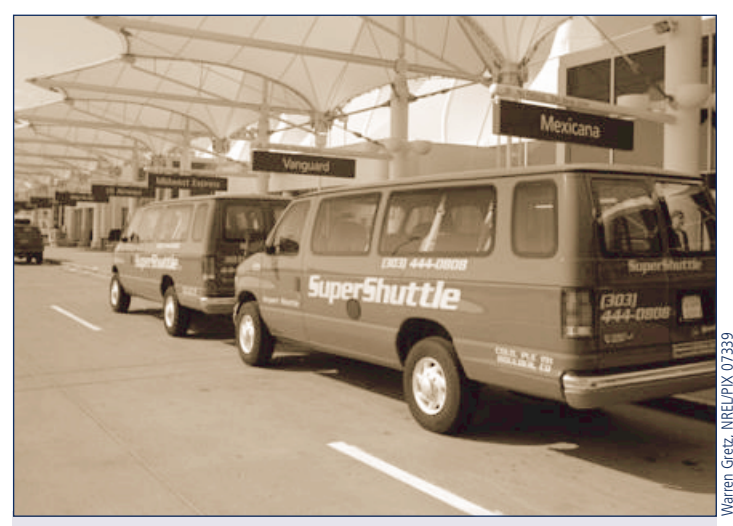
Airport shuttles make excellent candidates for AFVs because of the centralized nature of their operations.

In last year's niche market survey, Clean Cities coalitions selected airports as the top priority niche activity center for alternative fuel vehicles (AFVs). Airport shuttles are vital to airport operations. Airport shuttles are capable of central refueling, and as high-mileage, high fuel use vehicles, they are well suited to AFV use. To help Clean Cities develop this important niche market, the Clean Vehicle Education Foundation has created an Airport Shuttle Information Tool Kit. The kit, funded by the Department of Energy, will be distributed to each designated Clean Cities coordinator, and features an overview of airport shuttle characteristics, marketing strategies, examples and case studies, vehicle information, and contacts for additional information.