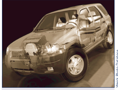
The hybrid-electric Ford Escape is designed to get 40 miles per gallon when it debuts in 2003.

In terms of fuel cells, we will have a demonstration program in the next couple of years.