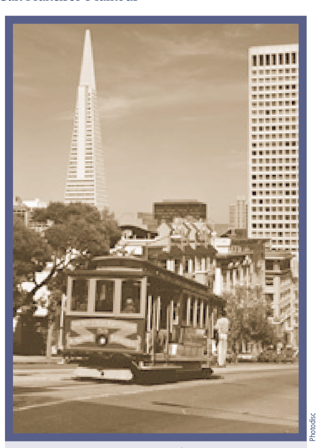
In addition to San Francisco's famous electric cable cars, the city has many innovative programs that encourage greater use of AFVs.

In another project supported by the Clean Cities Program, Budget EV rental cars became the first company to rent NGVs and HEVs in the San Francisco Bay area. Budget EV, which rents exclusively environmental vehicles, is located at the San Francisco International Airport. In a recent press release, Mayor Willie Brown, Jr. stated, "These natural gas and hybrid-electric cars are good for the environment, reduce our dependence on foreign petroleum, and they now have access to High Occupancy Vehicle (HOV) lanes. If you need to rent a car, this is clearly the way to go."