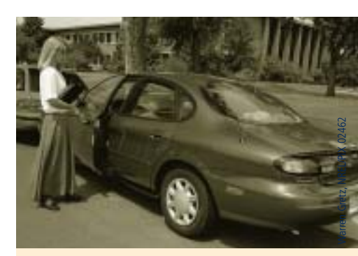
The AFV resale market is an emerging opportunity for both fleet purchases and private individuals.

in a special section of its Web site. NGVC's market exchange, located at www.ngvc.org/mktexch.html, typically features seven to ten vehicles at one time. "People have found the site to be a viable medium for selling vehicles," said NGVC's David Steele, Director of Communications and Member Services.