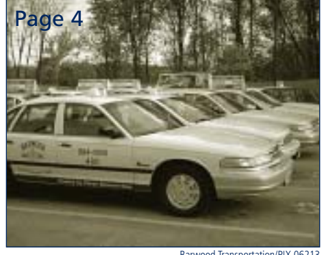
Barwood Transportation/PIX 06213

An emerging opportunity for a growing market