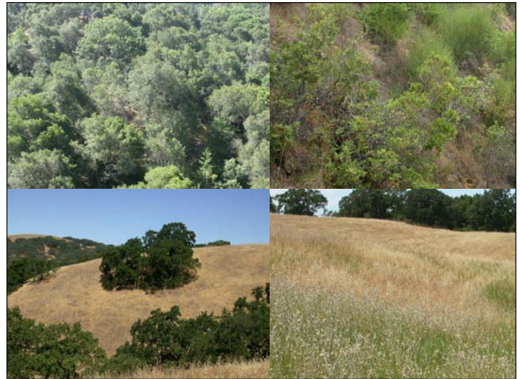
The 13 vegetation associations on Mt. Wanda represent four vegetation classes: (from upper left to lower right) forest, shrubland, woodland, and grassland.

Taking a close look at the forest or open meadows reveals that there are often subtle differences in plant species across a wide landscape. Unique micro-climates, exposure to the sun, soil types, moisture availability, and a variety of other factors influence the types of plant species present in any given location. Changes in any of these factors will cause changes to the vegetation community which in turn also affect the different animal species inhabiting them such as birds and butterflies. Identifying and monitoring long-term changes in the type and extent of vegetation communities provide insight into other large-scale changes such as the spread of invasive plant species, disease, or climate change.