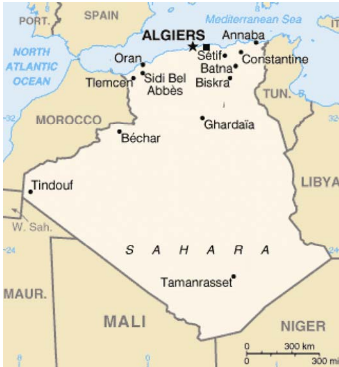
Figure 1. Map of Algeria showing where sandflies were trapped (■).