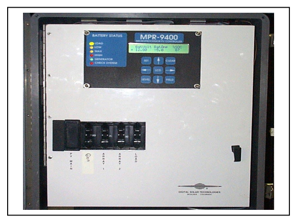
Fig. 2. Digital Solar's MPR-9400 System Power Center, Charge Controller, and SCADA system.