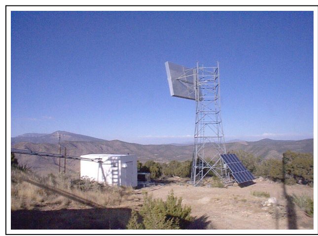
Fig. 1. Sandia's Mt. Washington Telecommunication Site.

The Mt. Washington site is being monitored to evaluate the performance of the new Deka valve-regulated lead-acid (VRLA) G-75 gel battery and the Digital Solar MPR-9400 system charge controller and power center. Previous experience with photovoltaic systems identified the battery and charge controller as the source of the most common performance and life-cycle cost drivers [1,2]. The evaluation is part of an effort to improve system design, charging strategies, battery technology for photovoltaic systems and reduce life-cycle cost using both laboratory and field test data.