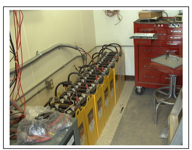
Fig. 3. Deka G-75 Gel VRLA Battery.

The battery, a Deka 258 Ah G-75-7 VRLA gel, is an industrial motive power battery configured in two parallel strings for a total rated capacity of 516 Ah (see Fig. 3). The system load profile is primarily a continuous 3 to 4-amp load with intermittent load spikes up to about 15 amps depending on the use of the radio transmitters and AC cooling fan. Normally, the total daily load is less than 80 Ah, and the nighttime battery discharge is usually about 50 Ah or slightly less than 10% depth-of-discharge.