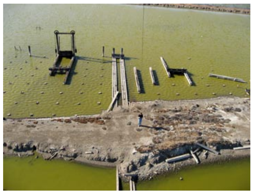
The ruins of a landing on what was once the bank of Beard's Creek (September 2006)

Meanwhile, the salt ponds changed as small operations were subsumed by