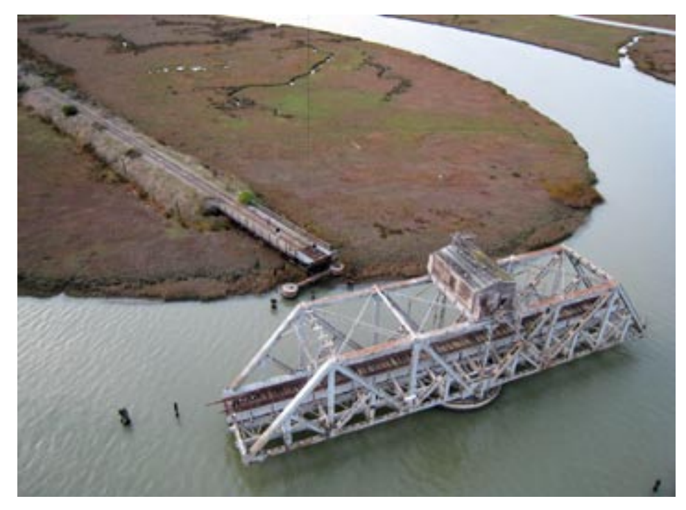
This swing bridge carried rail traffic on the Dumbarton Cutoff line across Fremont Slough (November 2006)