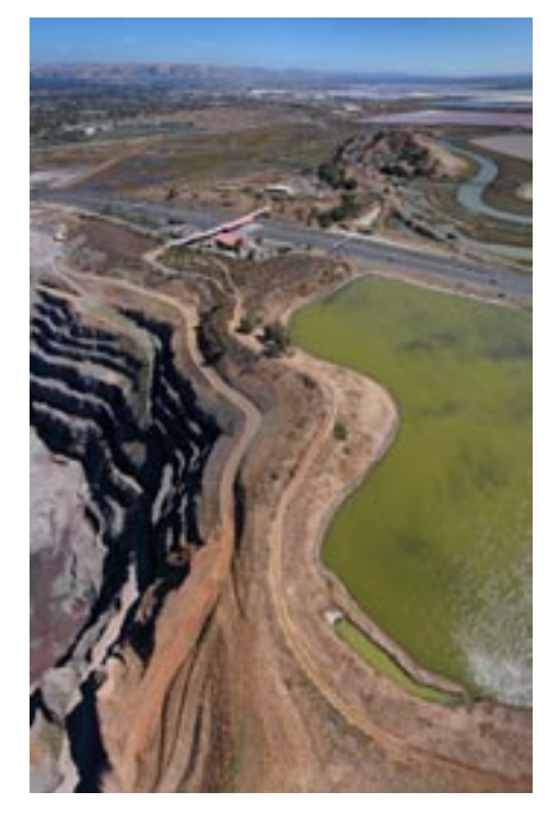
Panorama of the Red Hill Gravel Quarry with Arden Salt Works site in the distance (February 2008)

Red Hill Quarry (37.538002°N, -122.077760°W) – Just a stone's throw to the north of today's Dumbarton Bridge Toll Plaza lies what some believe is the deepest place in the United States. An examination of early aerial photographs shows that the site of the Red Hill Gravel Quarry experienced minor quarrying before operations ramped up in the 1970s. At that time the site was indeed a hill, rising some 150 feet above the plateau of salt ponds at sea level. As the years rolled by excavation continued until the hill disappeared, replaced by an open pit. The pit grew deeper and deeper