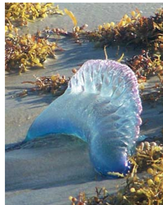
Portuguese Man O' War nestled in sargassum seaweed

Visitors are surprised to discover that the Portuguese Man O' War is actually not a "true" jellyfish. The true jellies belong to a separate class of animals, and are actually individual animals. The Man O' War is not a single animal, but rather a colony of many specialized creatures called hydrozoans that all work together for the benefit of the community. Amazingly, they are able to sail the open seas, capture and digest food, distribute the nutrients throughout the colony, and manage to reproduce even without having a brain, eyes, or a heart.