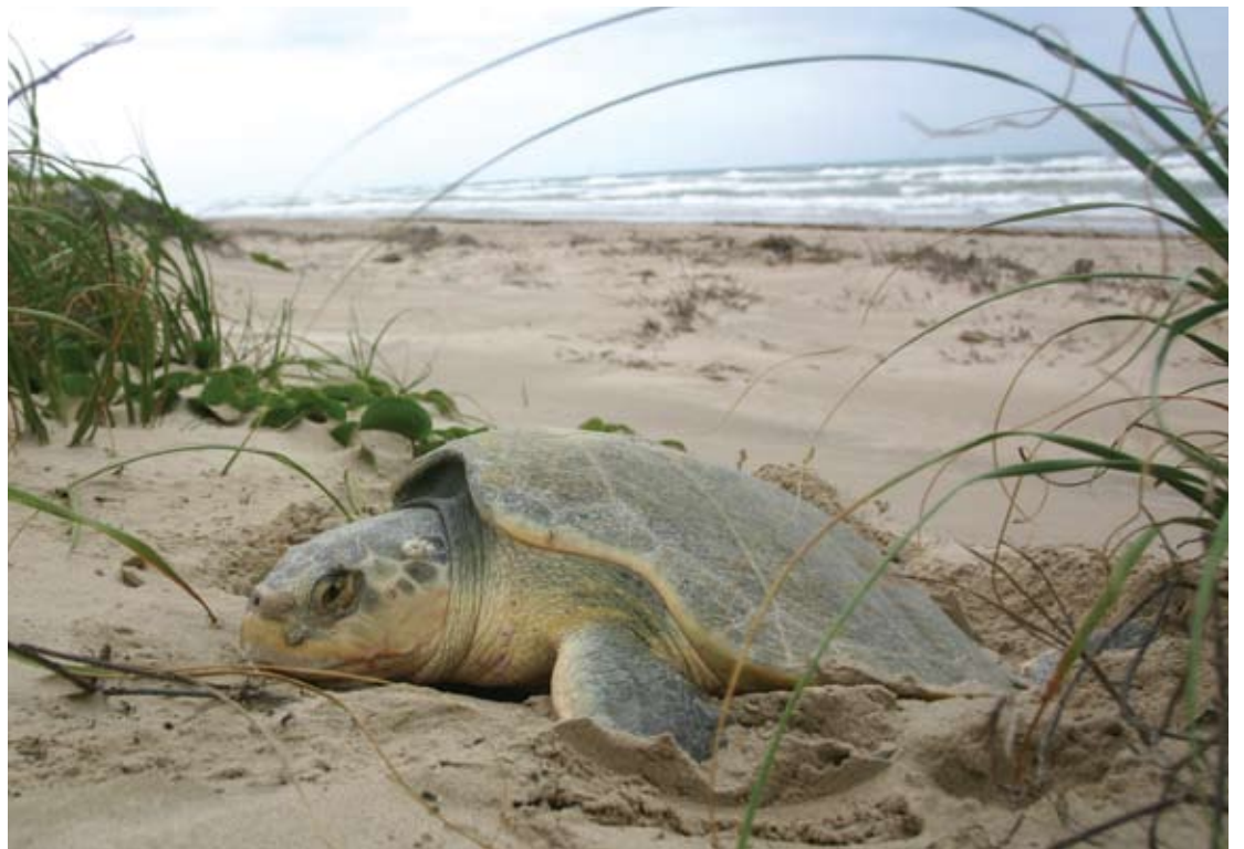
Nesting Kemp's ridley

We release the hatchlings from the eggs that we incubate and allow them to go free after they become very active. Each year, the public is invited to attend about 10–15 of the hatchling releases held between about late-May and late-August at the northern end of the park. No fee is charged to attend. For more information on these releases, visit our website at www.nps.gov/pais/ and call our recorded Hatchling Hotline at (361) 949-7163. Once nests are found and placed into our incubation facility, our web site is updated with the projected release dates. People wanting to attend a public release should look for dates when several clutches are due to be released. This provides insurance in case some become active and must be released in the middle of the night. As that potential release date nears, call the Hatchling Hotline for specifics on when and where the next release will be held.