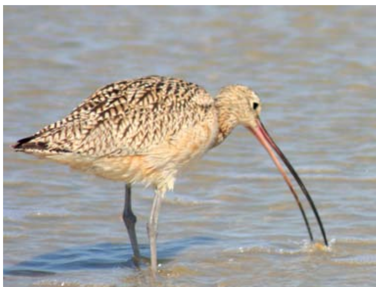
Long billed curlew foraging

In fact, Padre Island National Seashore has been recognized as both a Globally Important Bird Area by the American Bird Conservancy and as a Site of International Importance for Birds by the Western Hemisphere Shorebird Reserve Network. Both designations are an important step toward providing additional protection not only to birds and their habitats, but also to a variety of other animals and plants as well. The goal of conservation programs such as The American Bird Conservancy and Western Hemisphere Shorebird Reserve Network is to raise awareness and aid in the development of resources needed to protect species and habitat that are at risk.