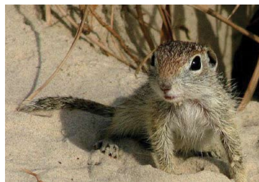
Spotted ground squirrel foraging

Spotted ground squirrels are predominantly vegetarian, but have been documented eating an occasional lizard or caterpillar. In the fall, their appetites increase as winter hibernation approaches. One of their favorite snacks is the dragonflies that migrate through the park. Because the dragonflies are too fast to catch, some squirrels have adopted an easier approach: they walk around the parking