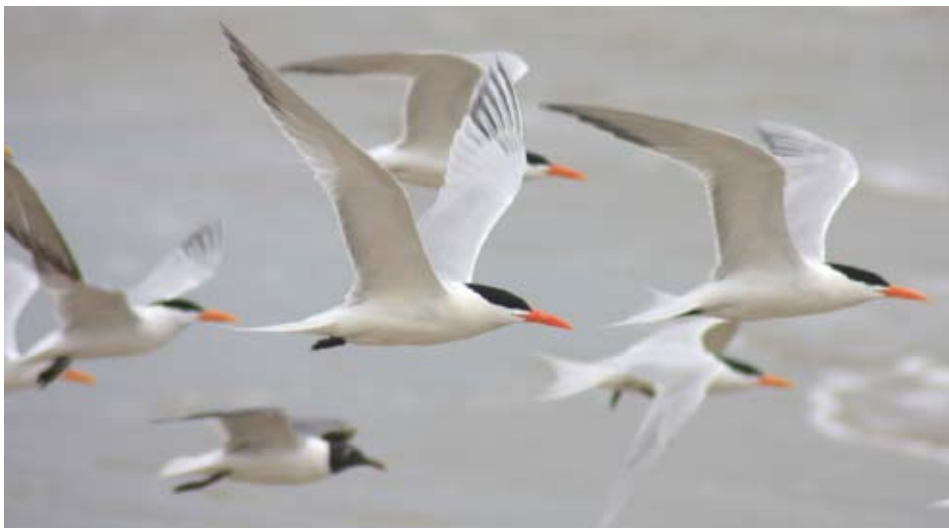
Terns in flight

A fish offering With bill outstretched she accepts Now they are married