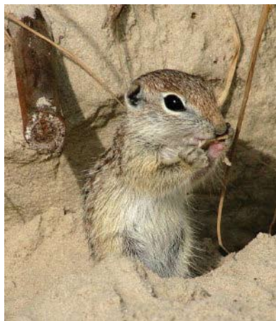
Spotted ground squirrel

To see a spotted ground squirrel will require visiting during late spring through early fall, because these animals spend the cooler winter months snoozing peacefully in their sealed-off, subterranean nests. As spring arrives, park visitors and staff enjoy watching the ground squirrels emerge from their burrows and frolic with each other on the dunes. Unfortunately, they quickly learn to approach picnicking visitors and beg for treats. Please note that even though they're incredibly charming and cute, it is illegal to feed spotted ground squirrels or any other park wildlife. Not only is human food bad for the squirrels, but being bitten or nipped by their sharp teeth is also cause for serious medical concern. As rodents, they can carry and transmit rabies and other diseases.