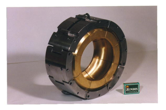
Fig. 2 Closed tuning clamp

There is a bronze jaw to each link. When curled up to a ring(Fig.2), the chain length can be adjusted with an M10 screw to produce change of diameter of assembly. Friction from relative circumferential motion between steel chain and jaws is reduced by needle bearings between steel and bronze parts. The bronze blocks are loosely attached to chain links, but left free to move circumferentially.