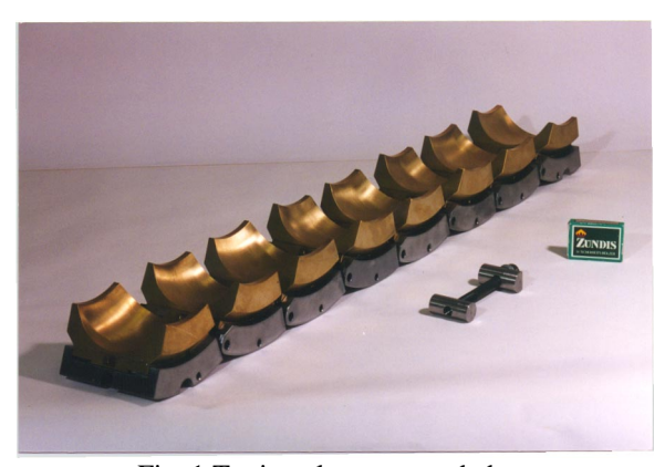
Fig. 1 Tuning clamp, extended

A steel chain with 8 curved links is fitted with bronze jaws conforming to curvature of links on the outside and to form of cell of cavity on the inside(Fig.1).