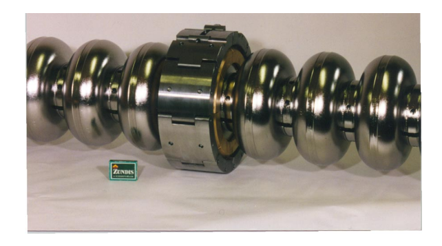
Fig. 3 Tuning clamp, closed over cavity

Change of clamp circumference and frequency shift \Delta f measured after again relaxing clamp, were measured and are recorded in Table 1 and plotted in Fig. 4. Total cavity length was also monitored and recorded. It is seen that ΔU must reach about 2mm before the cell will become plastic then df/dU rises sharply to, at around 3mm take on a constant value, allowing prediction of \Delta U needed to produce desired frequency shift. The target of \Delta f =100kHz was hit exactly with fourth tuning step. The tune was then conventionally restored by reducing the cell length(actually, the frequency change was 110Hz). From the cavity length values, also recorded in Table 1, it follows that the tuning clamp for \Delta f=100 kHz changed the cell length by only 0.15mm, which amounts to only 60% of length change of 0.25mm(corrected for overshooting targeted \Delta f ) caused by conventional tuning.