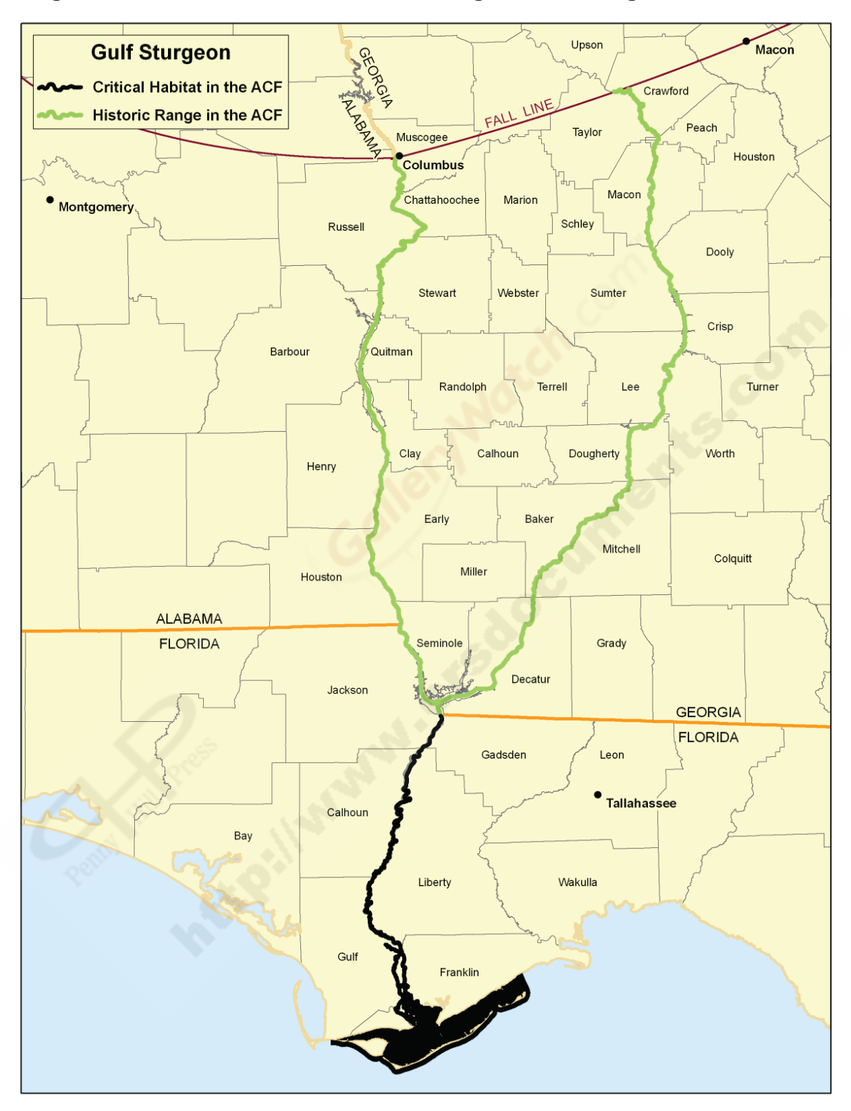
Figure 1. Critical Habitat and Historic Range of Gulf Sturgeon in ACF Basin