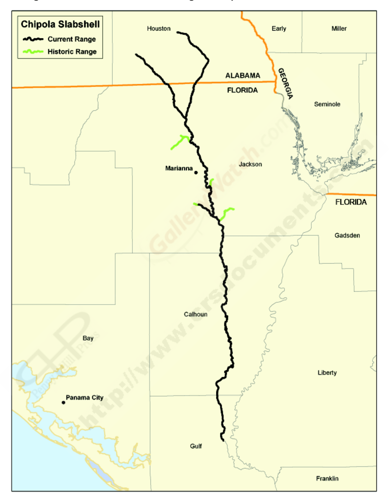
Figure 4. Current and Historic Range of Chipola Slabshell in ACF Basin