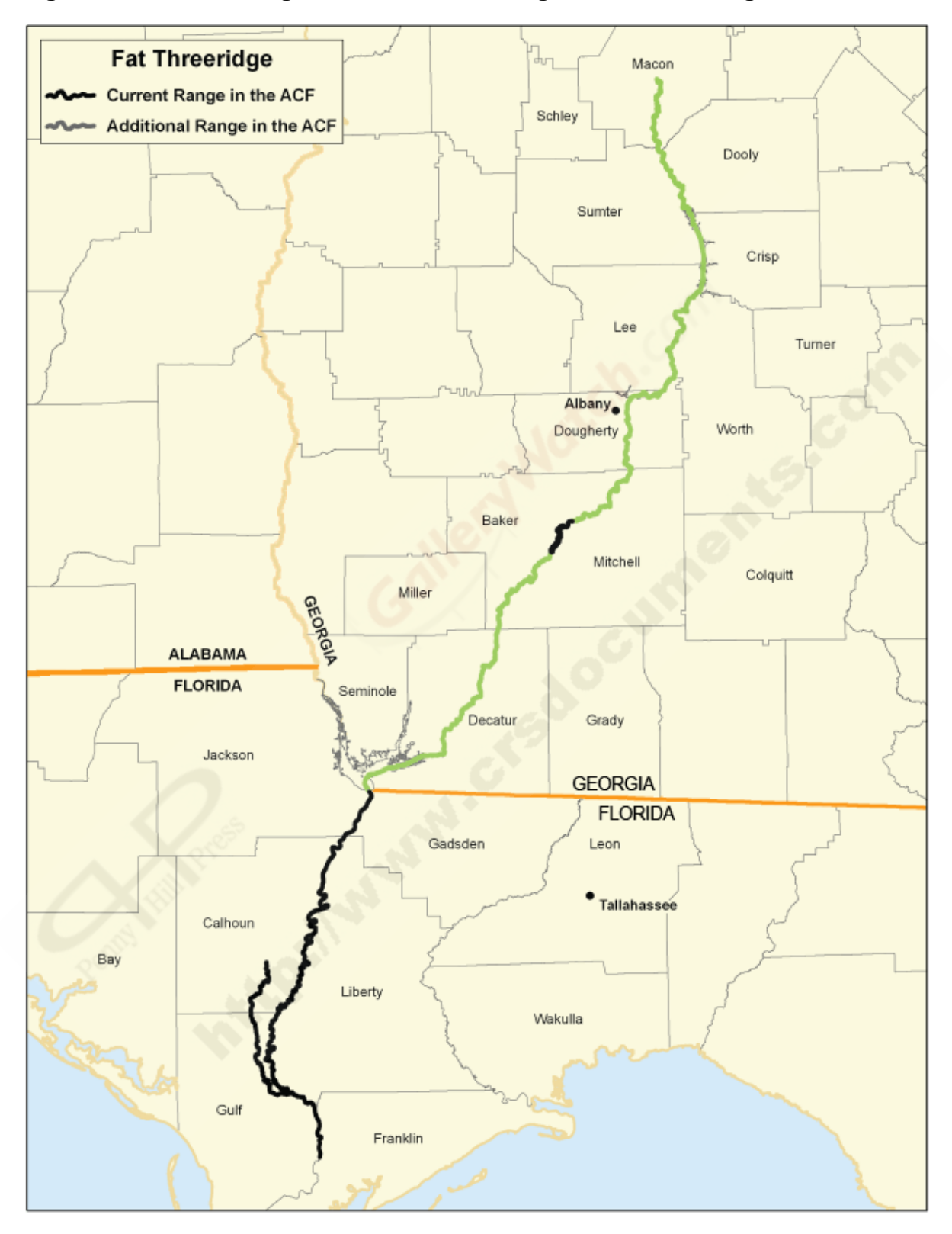
Figure 2. Current Range and Additional Range of Fat Threeridge in ACF Basin