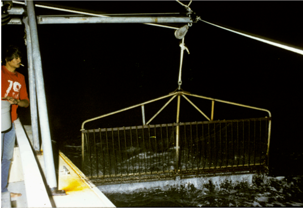
Plate 1. Trawl being deployed.