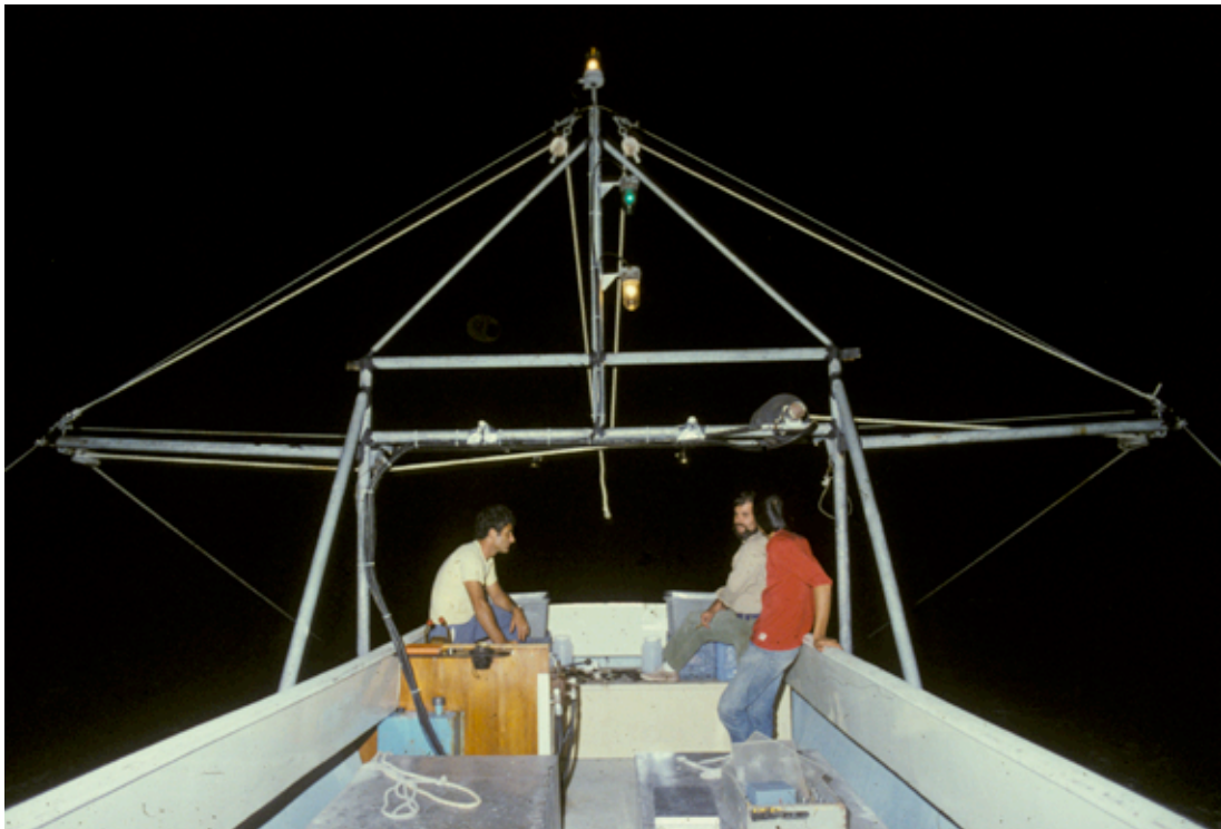
Plate 2. Sampling at night.

Tabb, D. C., and N. Kenny. 1969. A brief history of Florida's live bait shrimp fishery with description of fishing gear and methods. Proc. World Scient. Conf. Bio. Cult. of shrimps and prawns, FAO Fish. Rept., 3(57):1119-1134.