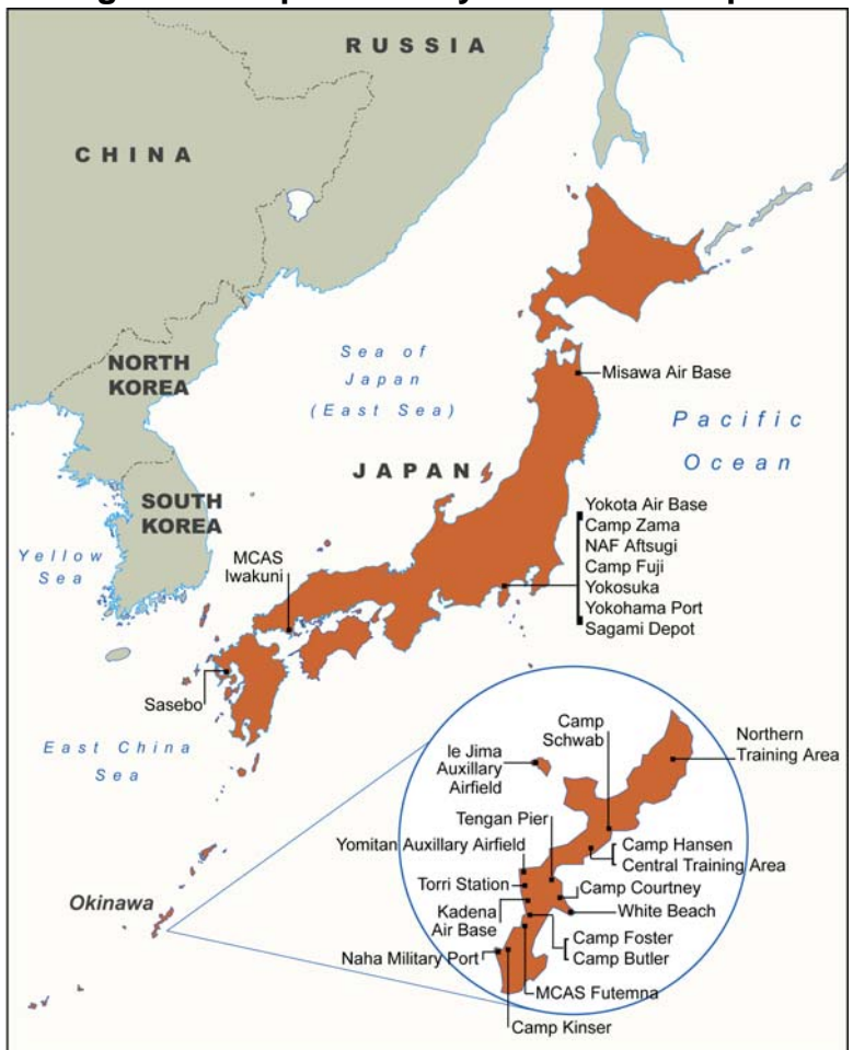
Figure 2. Map of Military Facilities in Japan

Cooperation on Missile Defense. A U.S.-Japan program of cooperative research and development of anti-ballistic missiles began in 1999. The decision to acquire the ground-based U.S. Patriot Advanced Capability-3 (PAC-3) system and the ship-based U.S. Standard Missile-3 system was justified largely on the basis of North Korea's missile program. In December 2005, Japan's Defense Agency agreed that Japan will pay over $1 billion for the project over nine years. Following North Korean missile tests in July 2006, officials announced that the deployment of the PAC-3 system to Okinawa would accelerate, starting the deployment in August 2006 instead of the previous date of March 2007. The system includes 600 new U.S. troops.