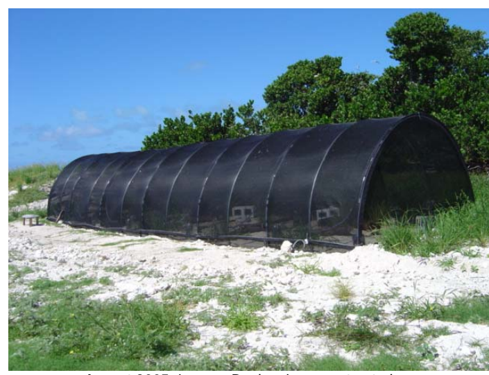
August 2005. Laysan Duck aviary constructed.