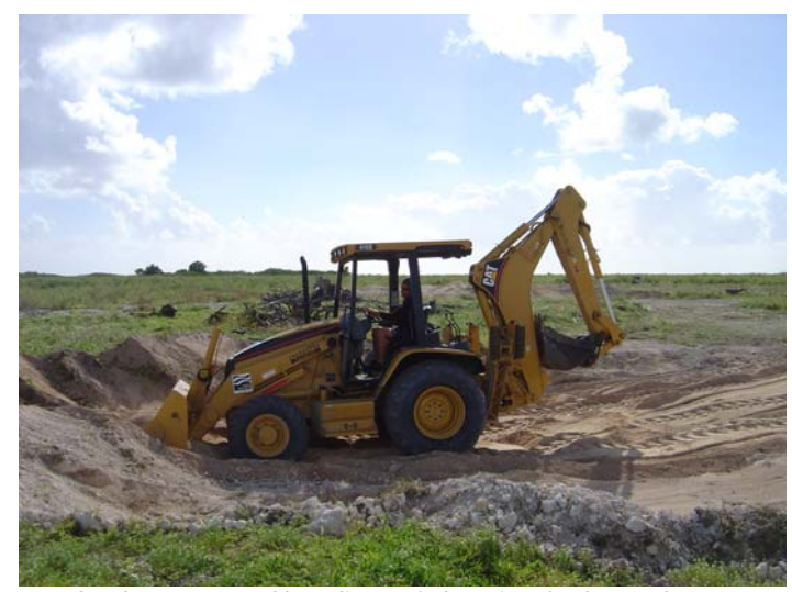
October 2004. Backhoe digs 10 ft down into freshwater lens.