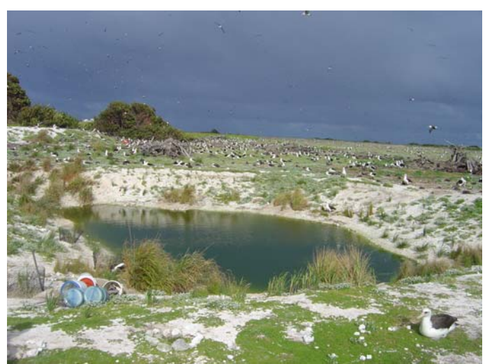
April 2005. Native plants begin to take hold.