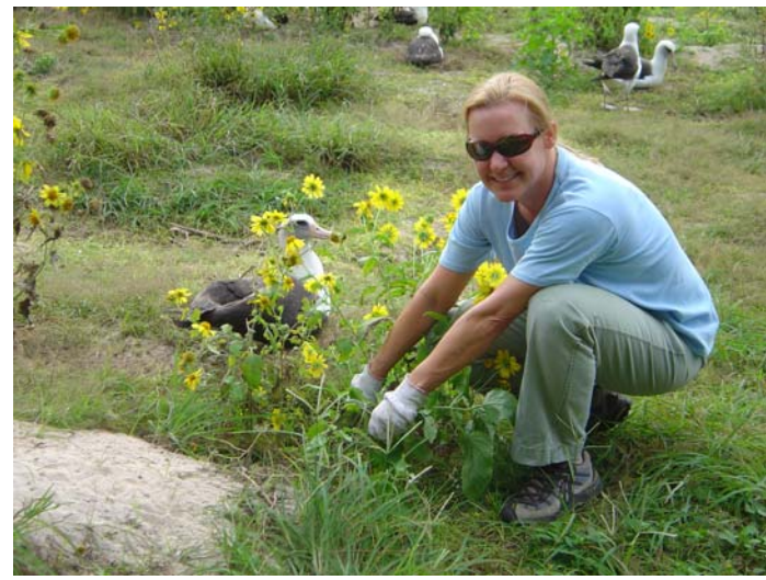
July – August 2004 Verbesina hand-pulled.