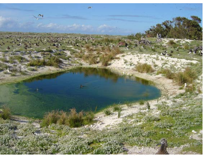
April 2005. Migratory scaup using wetland. Plants growing.