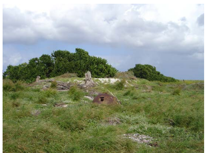
September 2004. Verbesina cleared and piled.