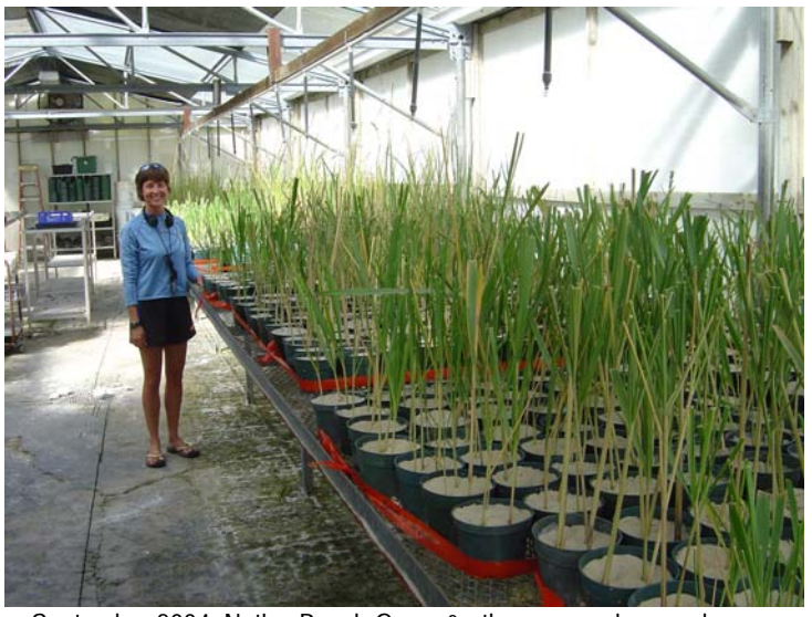
September 2004. Native Bunch Grass & others grown in greenhouse.