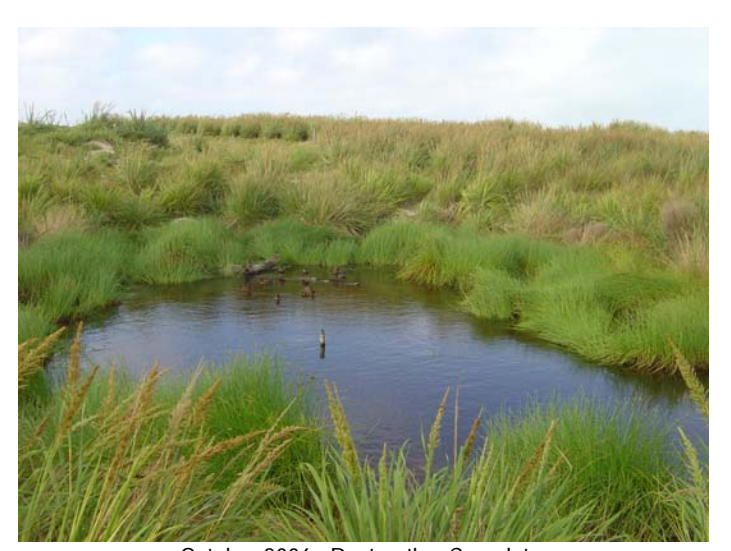
October 2006. Restoration Complete. Native plants mature and reintroduced and fledged Laysan Ducks present.