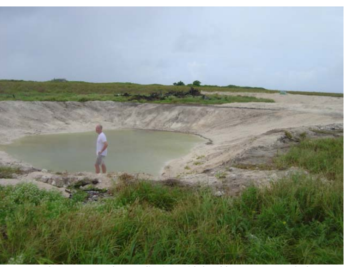
November 2004. 60 hours digging with backhoe. Water 3 ft deep.