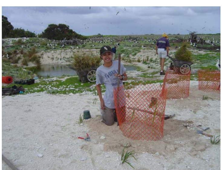
March 2005. Native grass and sedge planted and fenced.