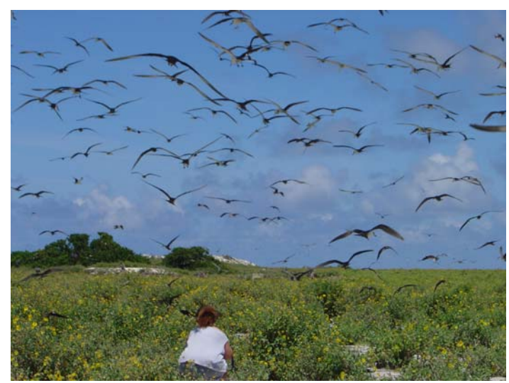
July 2004. Invasive plant Verbesina encelioides throughout area.