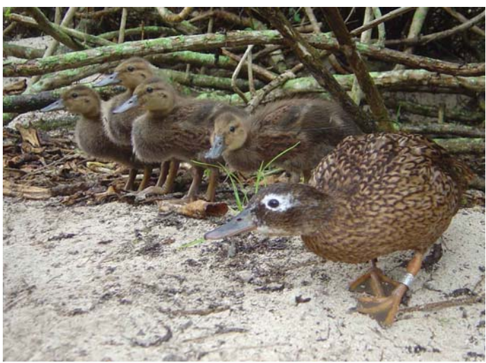
Spring/Summer 2006. Laysan Ducks nest on Eastern Island.