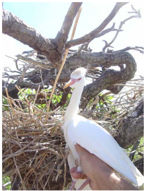
April 2005. Nonnative cattle egret nesting is eliminated.