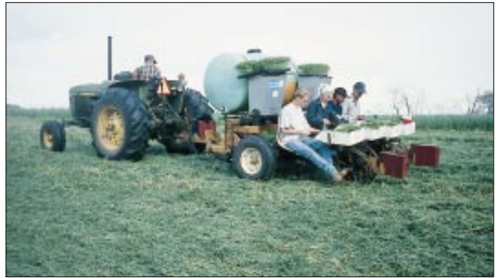
No-tilling vegetables into cover crop.