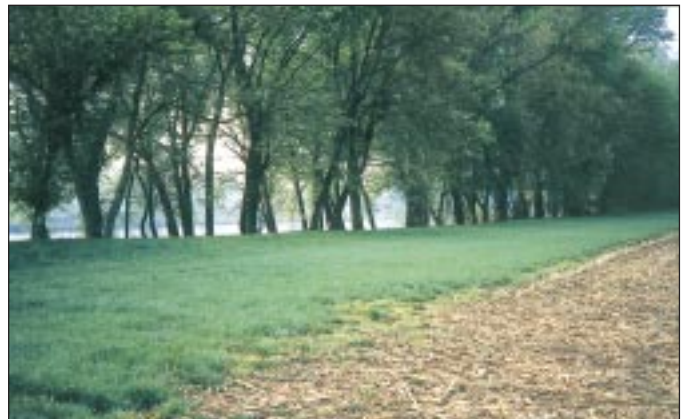
Riparian Forest Buffers