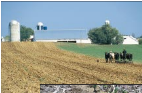
Residue is managed in many ways.