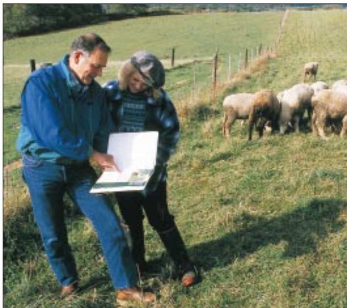
Assistance is available to help you plan what's best.

Silt is the most common pollutant of our surface waters. Controlling sheet and gully erosion on all land is the first step in reducing sediment and improving water quality. Since erosion control practices both assure the continued productivity of our cropland and protect water quality, they are listed first in this publication. Practices that specifically address water quality and other resource concerns are found in the latter portion of the Catalog.