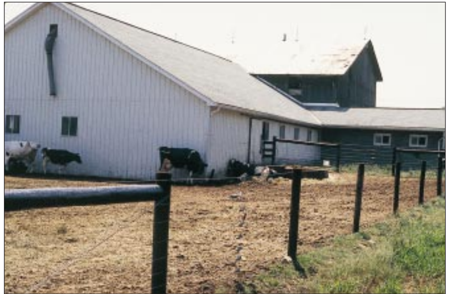
One year later