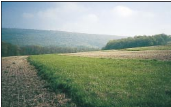
Contour Buffer Strips