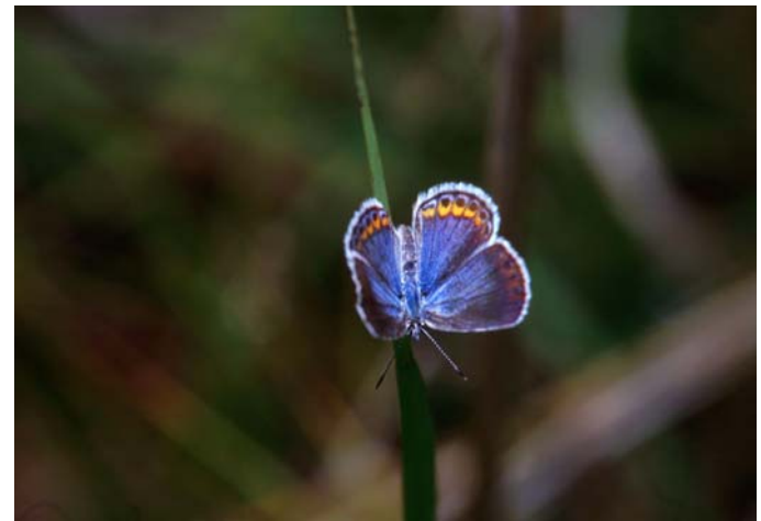
Karner blue butterfly (USFWS)

At the time of the original land surveys in the 1850s, oak savannas covered more than 4.5 million acres of Wisconsin's landscape. Today, fewer than 5,000 acres of savanna can be found in the state. The habitat is characterized by prairie grasses, intermittent brush and widely scattered, mature