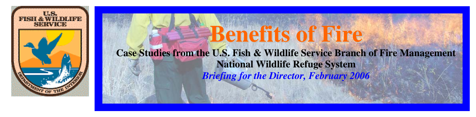
"The mission of the National Wildlife Refuge System is to preserve a national network of lands and waters for the conservation and management of fish, wildlife, and plant resources of the United States for the benefit of present and future generations."