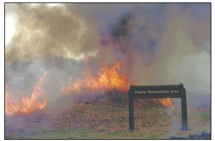
A controlled burn removes invasive weeds and revives prairie grasses.

wildfire toward town, since the prevailing winds routinely come from the northwest.