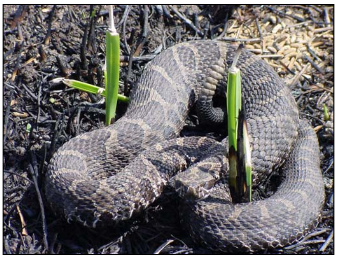
An eastern massasauga rattlesnake returns to a burned area at Squaw Creek NWR in Missouri. The species is state-listed throughout its range.

Most U.S. Fish and Wildlife Service lands evolved with fire and depend on it for their ecological health. These lands require periodic fire to survive as productive wildlife habitat. Without the unique ecological benefits of fire, refuges suffer from the effects of invasive weeds, and could perhaps be destroyed when a wildfire finally strikes.