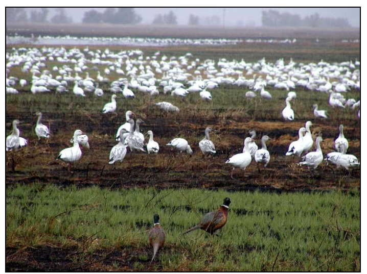
Snow geese and pheasants forage after a prescribed burn at Sacramento NWR.

Another prescribed burn in September 2005 was designed to enhance vernal pool and alkali meadow habitat by reducing invasive bulrush. The rampant growth of this invasive species was due to excess water seepage onto the refuge from breaks in a drainage ditch. The project called for a late-summer burn when the bulrush was completely dry. When bulrush is removed, native grassland and vernal pool species are able to germinate in the winter and spring. The results so far have been an increase in abundance and diversity of plants and wildlife.