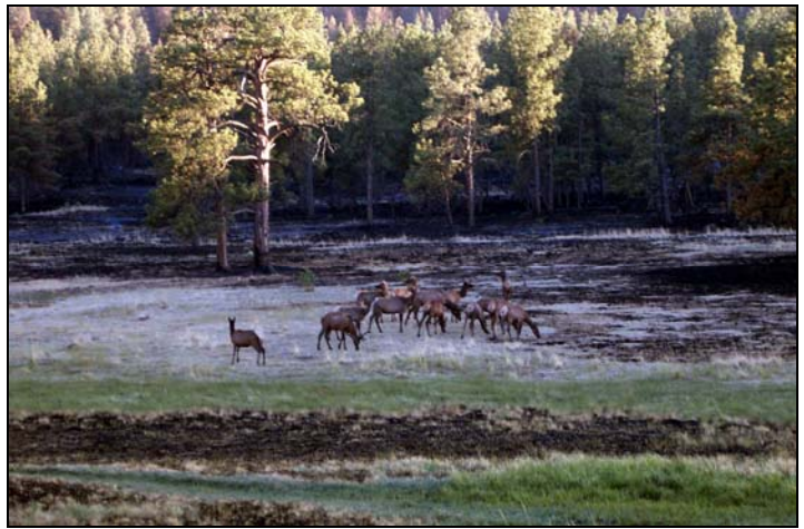
Elk herds seek tender new shoots in a burned meadow.

Lack of periodic fire in wild areas increases the risk of a catastrophic fire. It's really not a matter of if, but when it will happen. Such high-intensity, destructive fires result from hazardous fuel accumulations that may result in serious injuries or deaths for firefighters and the public; property loss or damage; adverse health effects and poor visibility due to periods of unmanageable smoke; loss of plant and animal species and their habitats, and damage to soils, watersheds and water quality.