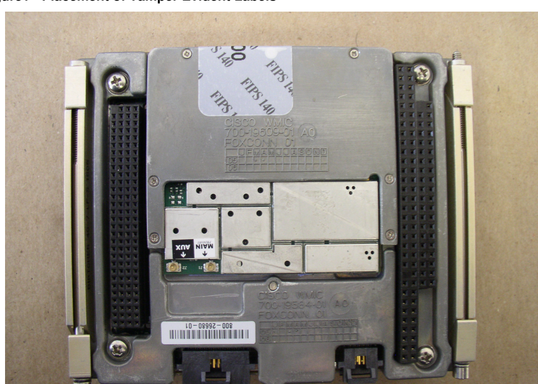
Figure1 - Placement of Tamper Evident Labels