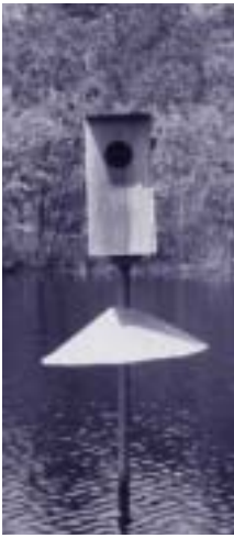
Wood Duck Nesting Box

Marshes and other wetlands were once seen as wastelands. They were drained and filled for development, landfills, or agriculture. In fact in North America, more than ninety percent of wetlands have been destroyed since 1900. As you've seen today, marshes are a diverse system that can be beautiful.