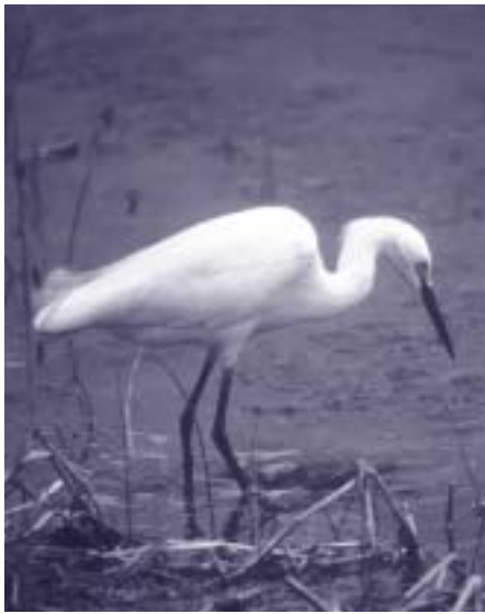
Lewis & Elizabeth Dumont

In the shallow ponds along the canoe trail, notice the narrow-leaved cattail, patches of pickerelweed, arrowhead, arrow arum and Phragmites. These ponds are favorite feeding grounds for long-legged wading birds like egrets, herons, and bitterns. Waterfowl use these ponds too. The seeds of arrow arum are an important food source for wood ducks. Geese prefer the roots of cattail. Near the refuge maintenance area at Foord's Landing there is a stand of old growth loblolly pines.