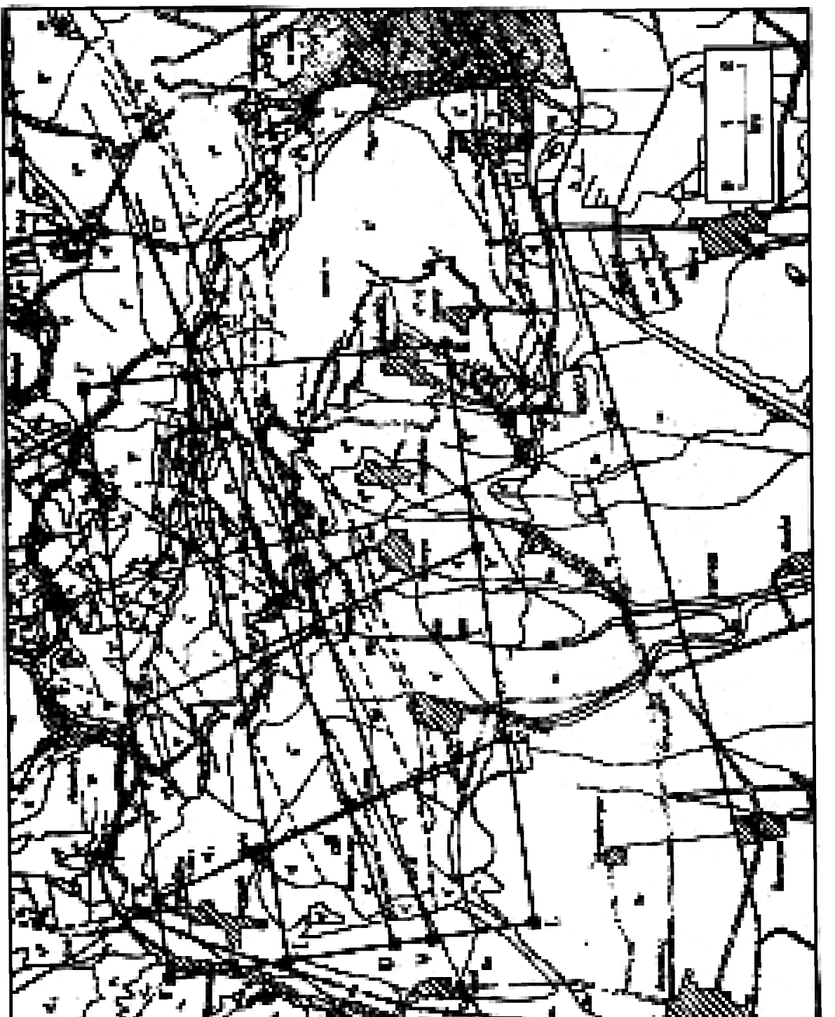
Figure 12.2. Geological map showing proposed study area.