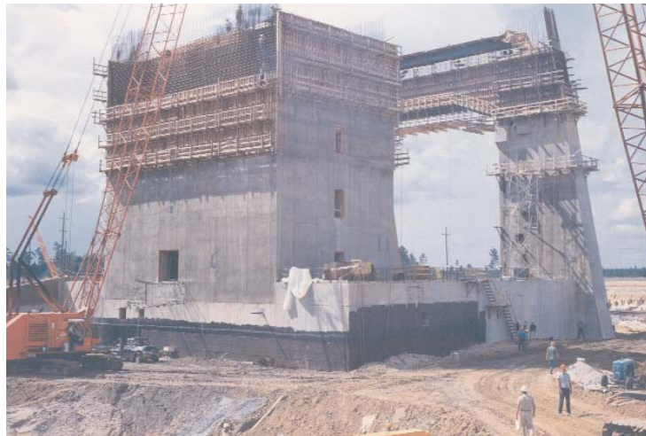
Completed in 1967, Stennis Space Center's A-1 Test Stand (left) was the site of the first S-II stage for the Apollo Program's Saturn V rocket Sept. 19, 1967. It was also the site of the first test on a space shuttle main engine May 19, 1975. The test stand is being modified for testing the Constellation Program's J-2X engines.

about to embark on the third generation of rocket engines to be tested on A-1, and we fully expect this test stand to be instrumental in developing and certifying these engines for years to come."