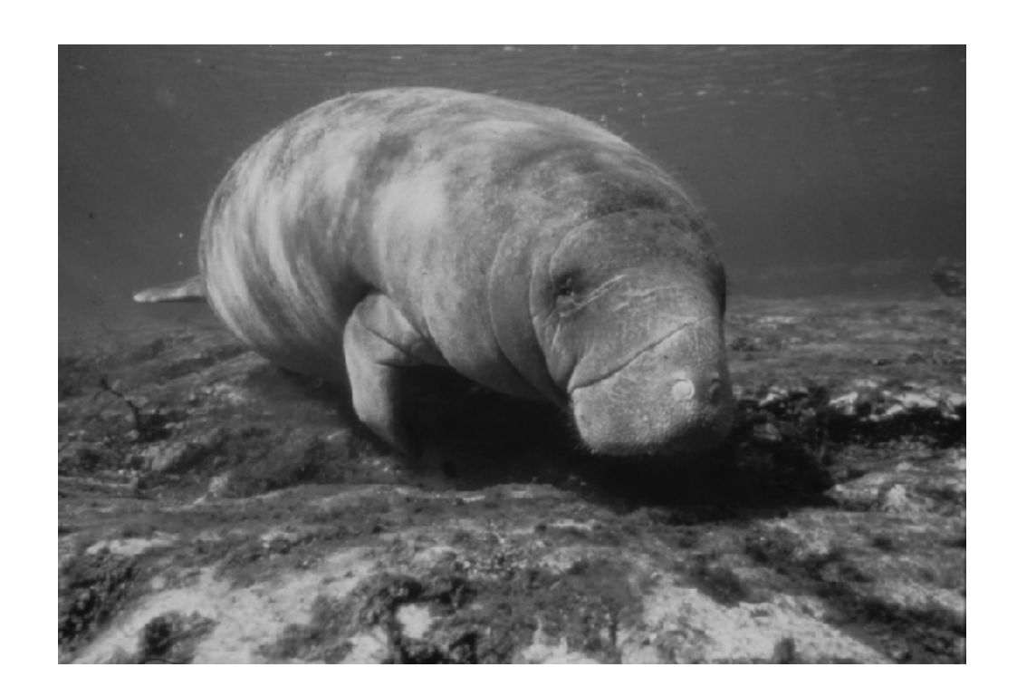
U.S. Fish and Wildlife Service Southeast Region

(Trichechus manatus latirostris) Third Revision