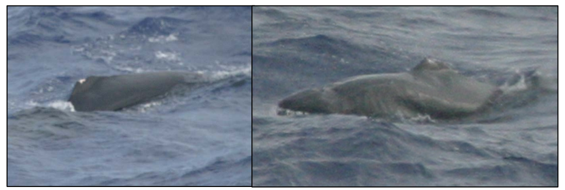
False killer whale with chopped off dorsal fin and evidence of emaciation, 4 Nov 2005.

We also had one interesting encounter with a false killer whale that had a damaged dorsal fin. It was later determined that the animal was badly emaciated when we reviewed our (distant) photos. The base of the fin was intact, but most of the fin was gone and the pinkish coloration indicated the wound had not entirely healed. One photograph clearly shows the animal's ribcage and sunken body. The health of this animal had apparently been compromised, rendering it unable to capture an adequate amount of prey to sustain a normal, robust weight.