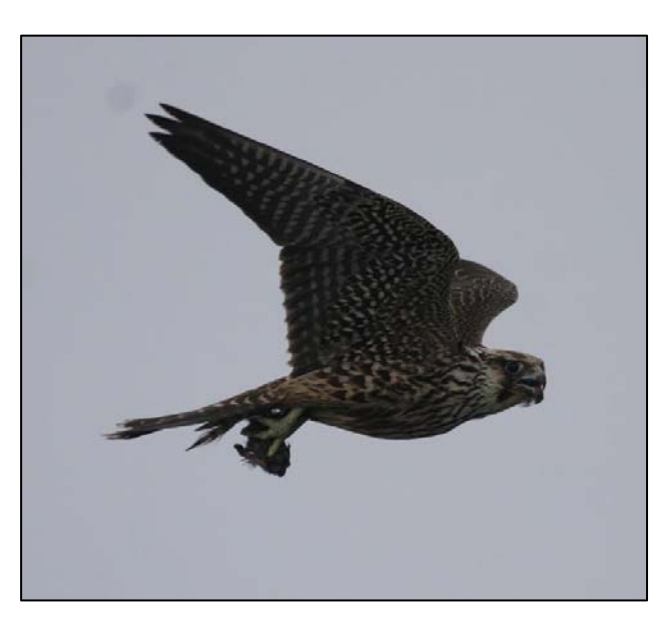
Fast-food takeout: Peregrine Falcon ( Falcon peregrinus ) with storm-petrel ( Oceanodroma sp.).

It was a wet and soggy week with plenty of rain—great weather for ducks! Perhaps that explains the unexpected wave of duck sightings spanning a couple of days. Surprising everyone was a femaleplumaged Lesser Scaup flying around the ship for almost an hour, about 120 NM north-northwest of Palmyra Atoll. Later that same day, a couple of femaleplumaged Northern Pintail settled on the stern wake, where the prop wash laid down the Beaufort 6 sea enough to resemble a prairie pothole. A couple of days later, a male Lesser Scaup buzzed the ship a few times before heading off to who-knows-where. Actually, these two species are fairly regular winter visitors to Hawaii; they just happened to miss their target. In keeping with the duck theme,