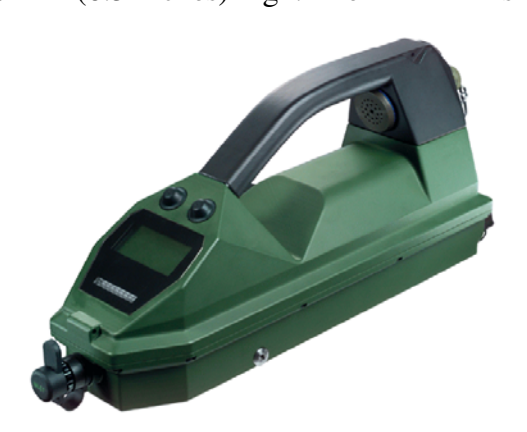
Figure 2-1. Bruker Daltonics Inc. RAID-M IMS

The RAID-M can be operated while being held in one hand. It has no protruding parts and weighs less than 2.80 kilograms (6.4 pounds), excluding battery. The RAID-M contains a small radioactive sealed source that is completely housed and is such that RAID-M can be stored in bulk. The RAID-M is 400 millimeters (mm) (15.7 inches) long, 115 mm (4.5 inches) wide, and 165 mm (6.5 inches) high. The RAID-M is of a one-tube design, with automatic polarity