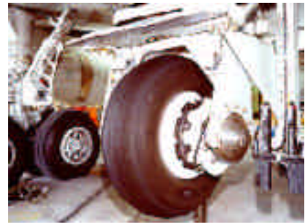
Shuttle Landing Gear