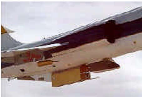
F-104 with pylon attached.

The craftsmen in the Sheet Metal Shop, at one time or another, work on every research and support aircraft flown at the center.