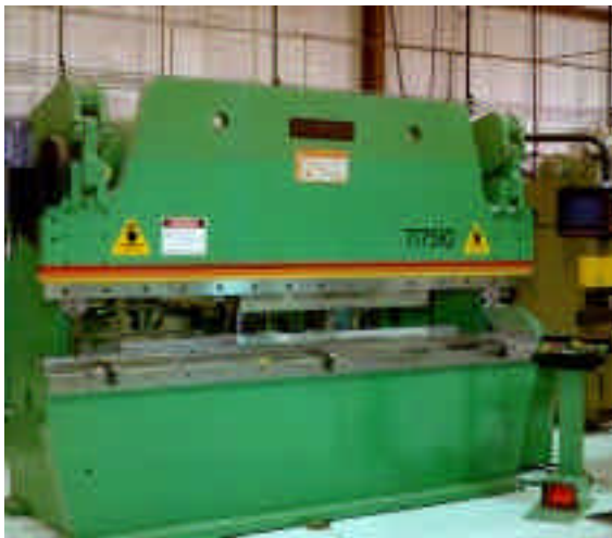
Hydraulic press brake

Other big, powerful hydraulic and electrically operated machines can bend, roll, punch, and press metal sheets, bars, and straps into all kinds of irregular and curved shapes depending on the project requirements. Pressures of as much as 2500 pounds per square inch (PSI) are common on some of the machines used in the Sheet Metal Shop.