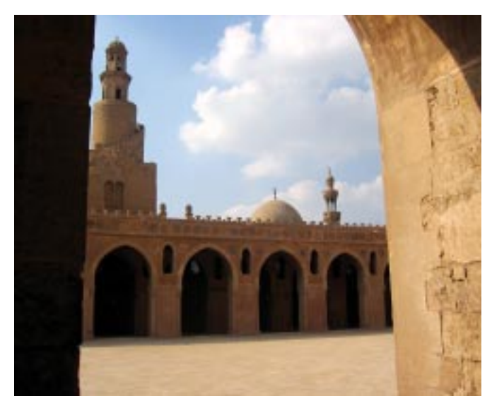
The Ibn Toulon mosque is famous for its minaret with an outside spiral ladder.