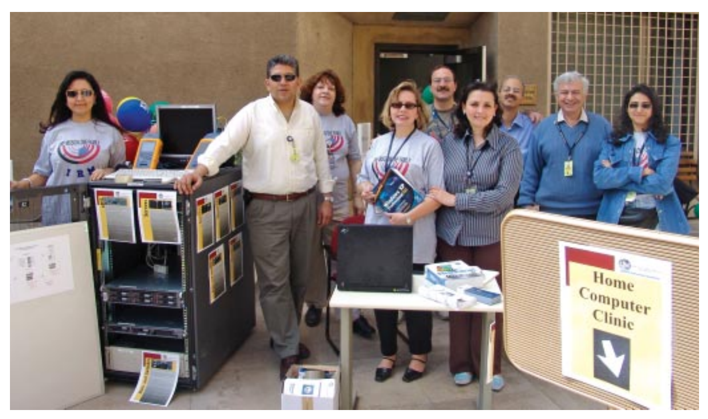
Opposite page: Morning in Cairo means bicyclists bearing trays of bread. Above: Participants in the Bureau of Information Resource Management's Mission Day learn about other sections and offices.