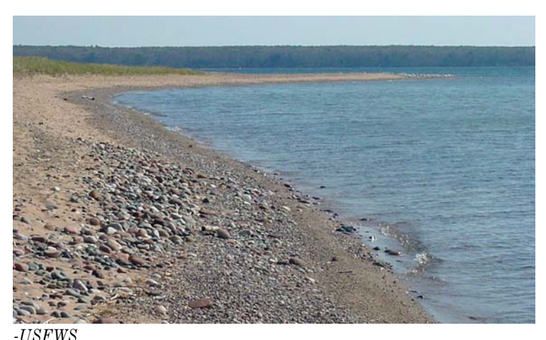
Coastal counties of the United States include the Great Lakes and comprise less than 25% of America's land area, but are home to more than 50% of our total population.

At the beginning of the strategic planning process, stakeholders across the Great Lakes provided insight into the internal and external factors that affect the Coastal Program's current performance or could affect future endeavors. That input provided valuable direction for the plan's design and content. Coastal Program