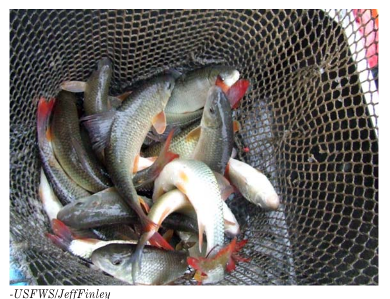
Displayed is a net-full of native river redhorse. These fish will be used in a snail control study in aquaculture ponds as an alternative to using non-native fish such as black carp.

The Meramec River runs north into St. Louis County, a convenient location to meet mid-way between Carterville and Columbia NFWCOs. By 10 a.m., we were shocking an unusually low river in a light drizzle hoping to get lucky. After about an hour of shocking, we had collected only a few other redhorse species. As we ventured further down stream, we noticed water streaming from a large culvert. The warm water smelled like a laundromat, and we quickly deducted it must be effluent from a treatment plant. As soon as the anodes of the electro-fishing boat entered the plume, redhorse and buffalo begin to roll to the surface. We shocked downstream for about