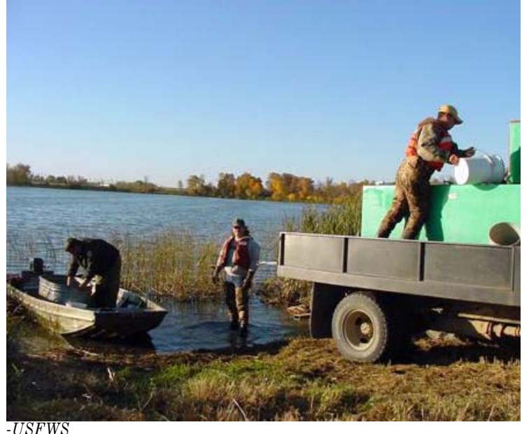
Walleyes are removed from Clifford Lake, located on the Rydell National Wildlife Refuge. Walleye fry are stocked each spring and trapped as fingerlings in the Fall to fill high priority stocking requests.