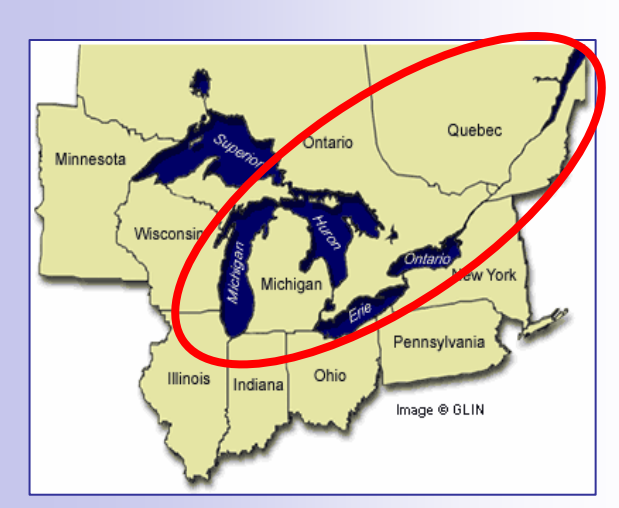
Sites of VHSV IVb isolation in the Great Lakes as of summer 2007.

The polymerase chain reaction assay has largely replaced the serum neutralization assay as a confirmatory test for VHSV. For the PCR assay to be broadly useful, it is important that the primers be located in regions of the virus genome that are conserved among all the strains of the virus that might be encountered. Following discovery of the Great Lakes strain of VHSV, sequence analysis of the new isolates showed that the primers recommended by the American Fisheries Society Fish Health Section Bluebook for PCR identification of VHSV were not optimal. The revised version of the VHS section of the Bluebook (available at no charge on-line at http://web.fisheries.org/units/fhs/VHS_inspection. html) contains new PCR primer sequences that are identical to those currently specified by the OIE Manual of Diagnostic Tests for Aquatic Animals. In addition, the revised VHS section of the Bluebook now recommends use of an extraction procedure for preparation of viral RNA from cell culture fluids rather than a simple heat treatment. These changes have resulted in the VHS sections of the Bluebook and OIE Manual becoming essentially equivalent.