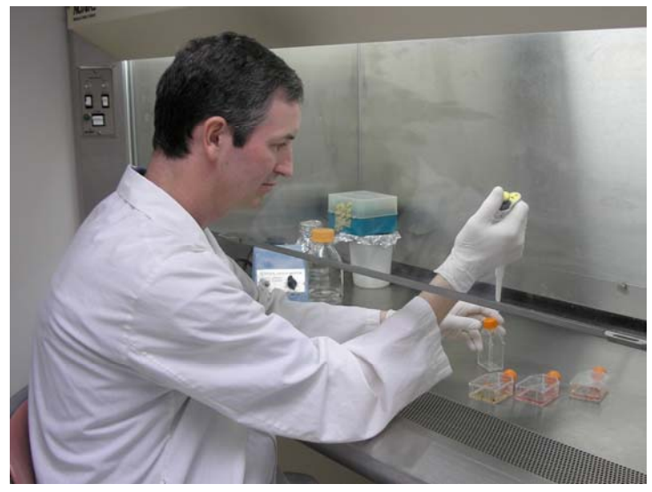
Cell culture and molecular assays are used for the detection and identification of fish viruses.

As of mid-2007, VHSV strain IVb has been isolated from fish in Lake Michigan, Lake Huron, Lake St. Clair, Lake Erie, Lake Ontario, the Saint Lawrence River, inland lakes in New York, Michigan and Wisconsin as well as the coastal areas of eastern Canada. The new strain has an exceptionally broad host range and has been isolated from over 25 species of finfish to date. Significant mortality has been reported in muskellunge, freshwater drum, yellow perch, round goby, emerald shiners and gizzard shad.