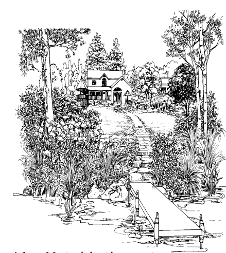
After...Native lakeside vegetation protects shorelines and lake water quality. Tall vegetation also discourages Canada Geese.