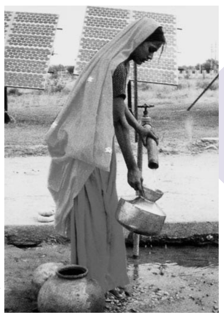
PV systems are being installed in villages in developing countries to help power vital applications—here, the pumping of potable water in India.

hough "photovoltaics" isn't a household word yet, last year more people than ever before learned more about PV-generated electric power—all over the world.