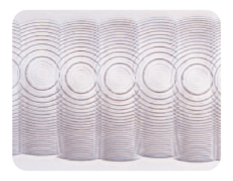
Photomicrograph of an array of multilevel diffractive lenses, fabricated with a 193 nanometer excimer laser.

Cynosure successfully designed and built a customized lenslet array to correct the beams from an array of 200 diode lasers. The researchers, however, failed to build a system that could generate the target power level — 20 watts of laser light from a medical optical fiber — because the company was unable to secure an adequate, low-cost supply of