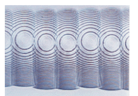
Photomicrograph of an array of multilevel diffractive lenses, fabricated with a 193 nanmeter excimer laser.

Cynosure successfully designed and built a customized lenslet array to correct the beams from an array of 200