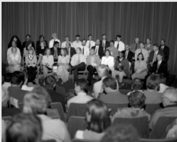
Ames 1998 Honor Awards winners gathered during the recent ceremony and celebration.

Ames Deep Space 1 Remote Agent Team Joint Strike Fighter Simulation Project Team Transport Cab (TCAB) Project Team Wind Tunnel and Simulation Divisions ISO Certification Team