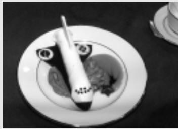
The Space Shuttle makes a perfect landing at SVMHS!