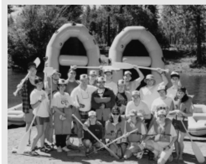
Astrobiology Academy students on July 4th during Lake Tahoe outing.

academic cross-section, including Harvard University, Abilene Christian University, Princeton University, Michigan State University, Colgate University and the University of California, Irvine. Areas of study ranged from astro-geophysics, medicine and mechanical engineering, to aerospace engineering and biology.