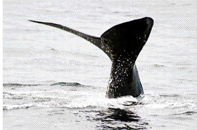
Whale Center of New England

Slapping, Flipper and Tail: When a whale hits the water with its flipper or tail