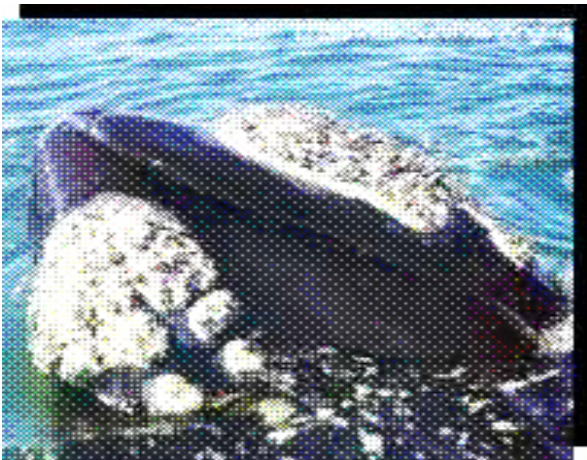
The Whale Center of New England

Right whale calves and mothers spend a long time together, like other mammals. The calf stays close to the mother, swimming up on her back or butting her with its head. The mother may roll over on her back and hold her calf in her flippers.