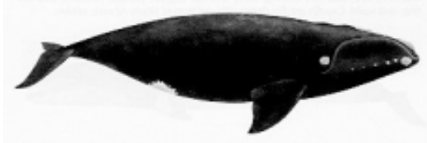
Right whales have no dorsal fin on their backs.