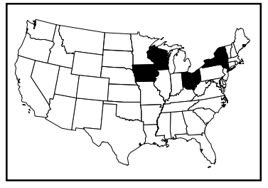
States in which northern monkshood is found.